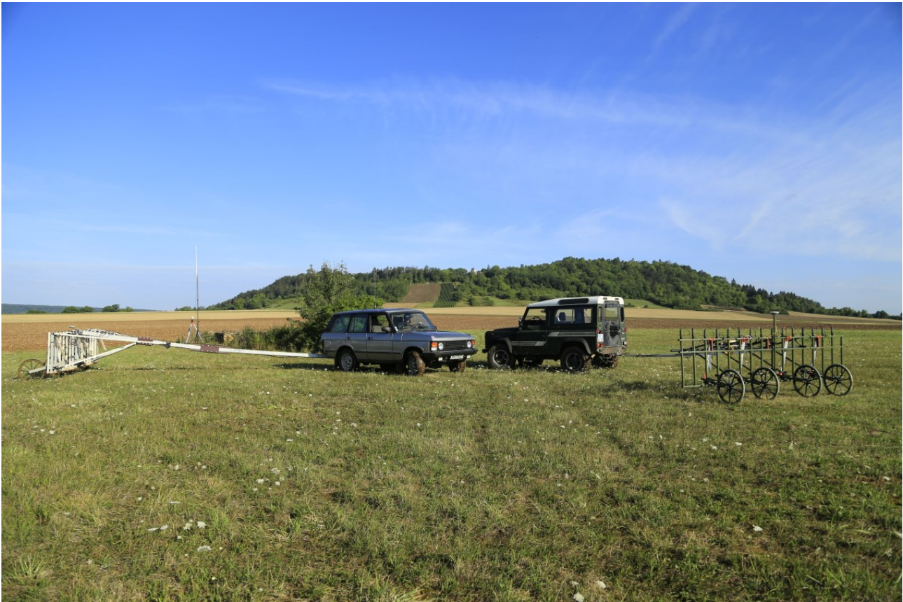
Fig. 1. Sensys MX V2 and V3 multisensor magnetometers in front of Mont Lassois.

number of other factors, including the location on the globe, the direction of measurement as well as disturbances caused by the vehicle or person moving the instrument.