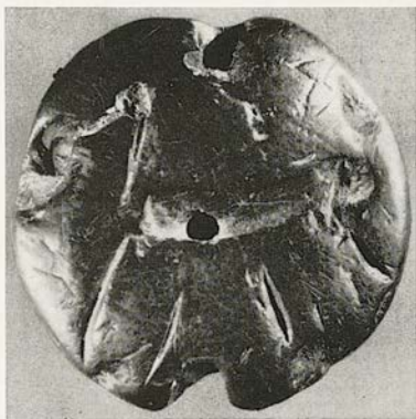
263. Birmingham 1 Grey steatite \phi 1,8. S. H. 0,2-0,3 Lentoid

Cretan goat to the right. Between the legs perhaps the stem of a tree.