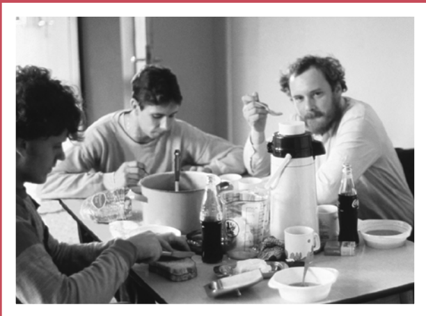
Martin having a break during excavation of the famous deer antler masks at the Mesolithic site of Bedburg-Königshoven, 1988.

Heuschen, W., Gelhausen, F., Grimm, S.B., Street, M., 2006. Eine Elchkuh aus der Eiszeit. Archäologie in Deutschland 2/2006, 5.