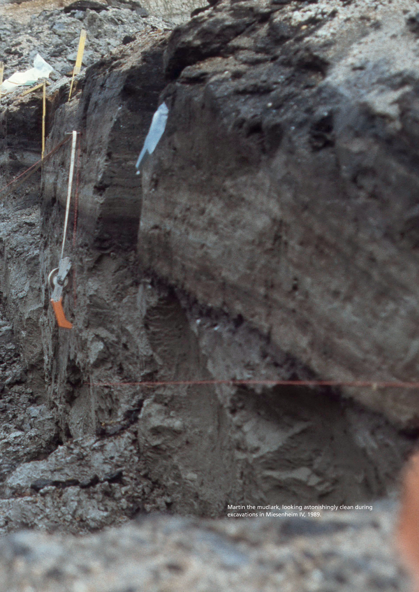
Martin the mudlark, looking astonishingly clean during excavations in Miesenheim IV, 1989.