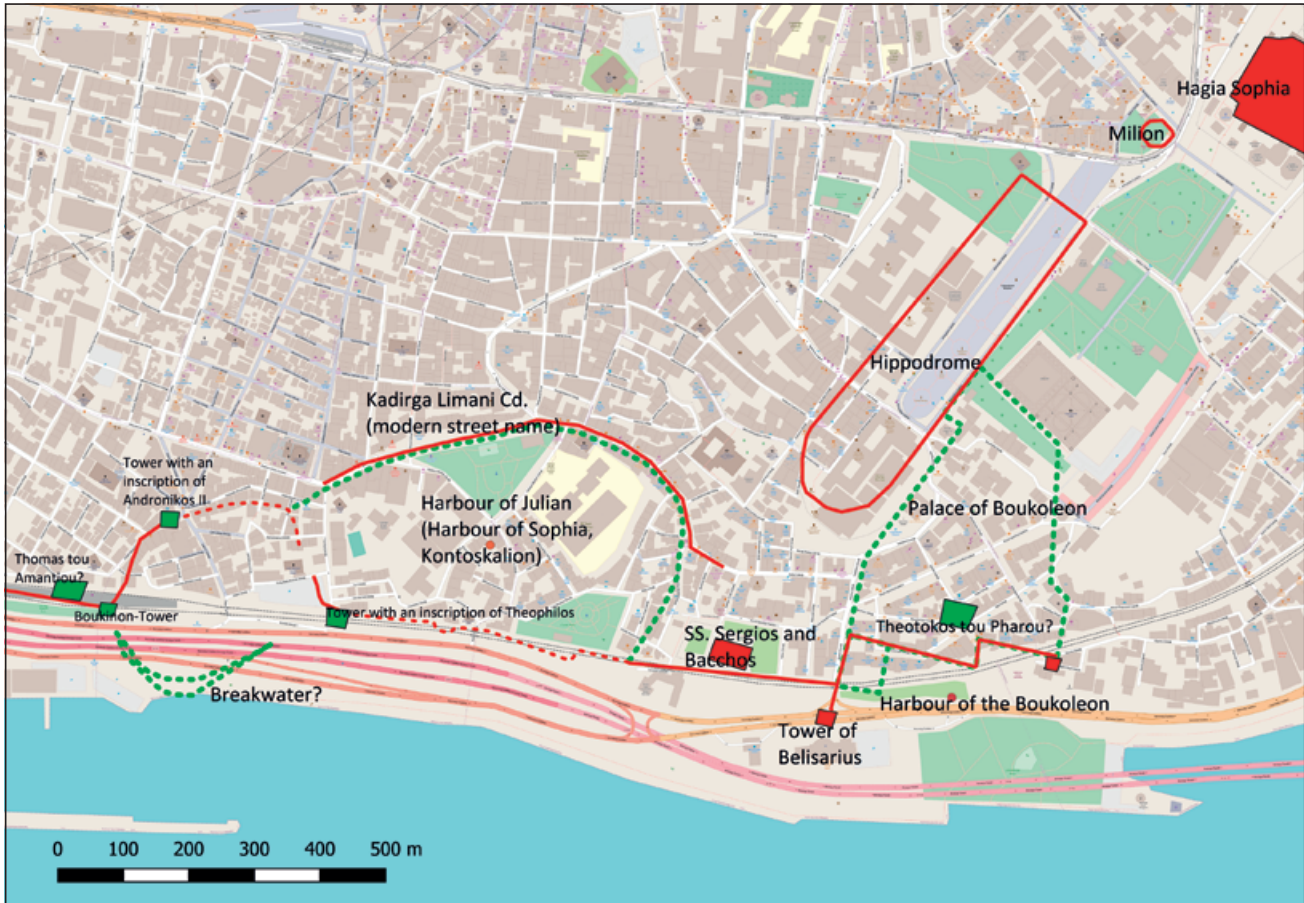
Map 1 Harbour of Julian and the Harbour of the Palace of Bukoleon, including selected buildings in their surroundings (preserved in situ or archaeologically proven in red; hypothetical in green) on a modern map of Istanbul. – (Open Street Map; edited by J. Preiser-Kapeller).