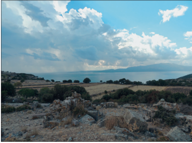
Fig. 3 Gulf of Adramyttium, view from Assos in the direction of Mitylène.

Nevertheless, the Latins' rule was short; after two decades, the whole area fell under the dominion of the Greek Empire of Nicaea in 1224. After 1261 again dominated by Constantinople, the landscapes around the Adramyttēnos kolpos finally slipped away from Byzantium at the beginning of the 14 th century. At the end of 1304 or beginning of 1305, the Turks dominated the entire region. In 1402, the Mongols invaded the hinterland of Edremit körfezi and reached even Assos (see fig. 3 ) in the far west, but this was just an intermezzo without any significant political impact.