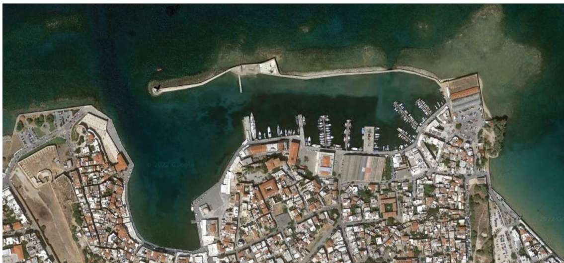
Fig. 5: Satellite photo of the supposed location of Kydonia's harbour, landlocked by a natural sandstone formation.

identified as the “closed harbour” mentioned by Skylax; this hypothesis is mainly based on Von Gerkan's idea, that a closed harbour was used for military purposes. 28 Moreover, this assumption is supported by the location of this same harbour basin within the city-walls, which probably ended in towers. 29