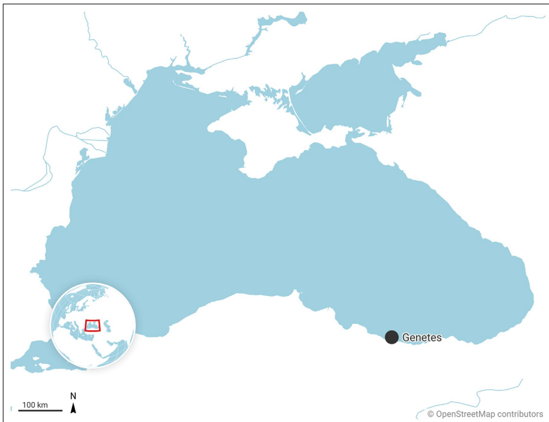
Fig. 3: Location of the “closed harbours” mentioned in the Periplus of Pseudo-Skylax , in the Black Sea.