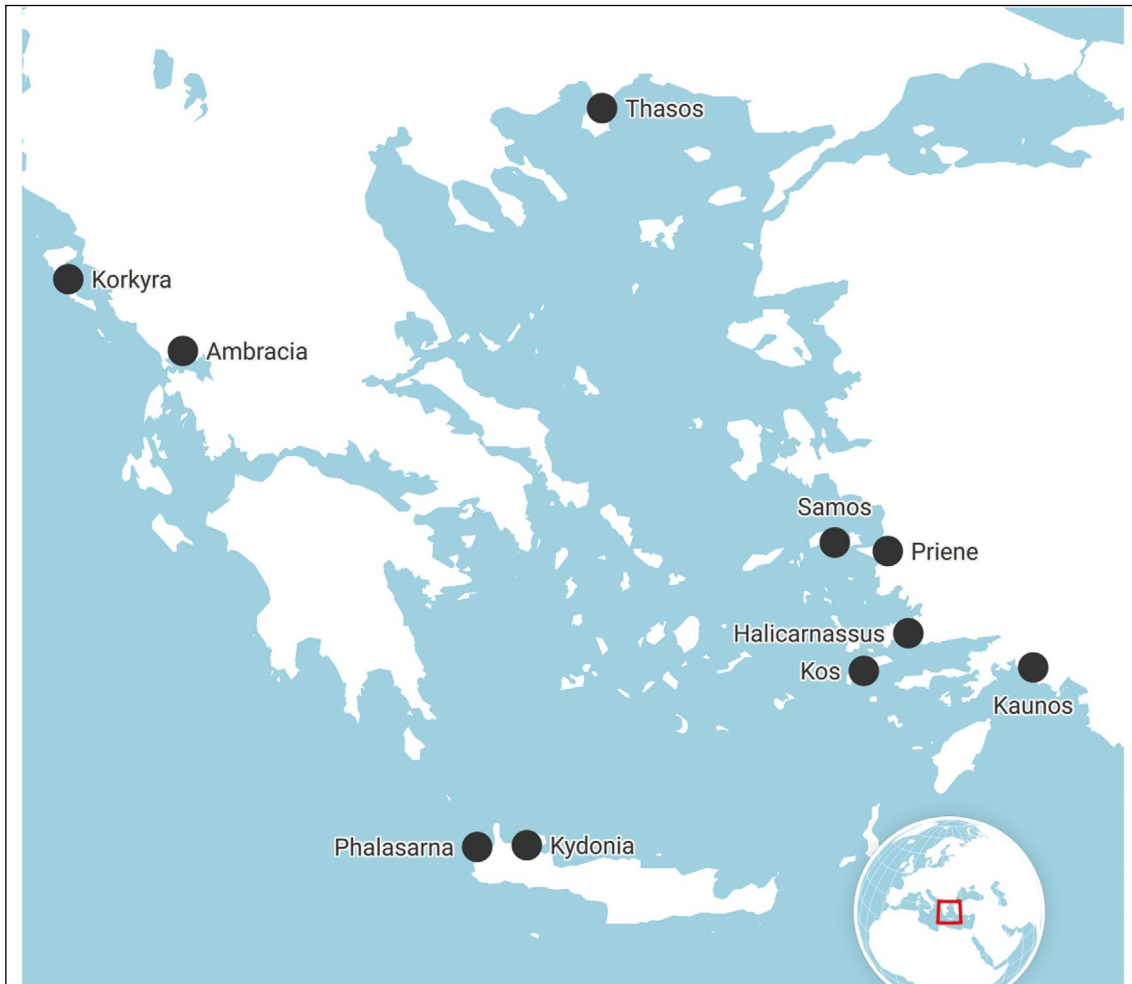
Fig. 1: Location of the “closed harbours” mentioned in the Periplus of Pseudo-Scylax, in the Aegean Sea.

“Monopolcharakter” of harbour cities located in the Mediterranean area. Following this theory, Lehmann-Hartleben identified 42 closed harbours among the 303 that he had previously classified.