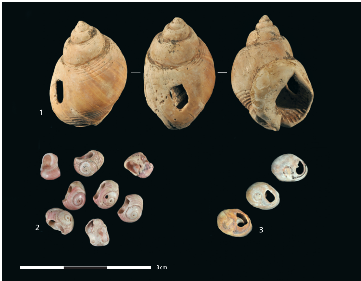
Fig. 3 Mediterranean marine gastropod species documented in Level 1 of Tito Bustillo Cave. 1 Tritia mutabilis ; 2 Tritia pellucida ; 3 Homalopoma sanguineum .

The Level 17 assemblage (n = 33,718) is characterized by the predominance of flint, while the percentages of quartzite is 14.2 %, and of quartz and calcite amount only 1.2 %. Limestone, lutite and other undetermined raw materials sum up to a total of 23.1 %. The tracer and super-tracer varieties in the flint assemblage (61.6 %) are Urbasa (2.4 %), Bidache Flysch (1.2 %) and Chalosse Flint (2.2 %) (Fontes et al., 2018). The lithic chaîne opératoire , based on the use of Kurtzia Flysch Flint and another two regional varieties, is quite complete with plentiful evidence of core preparation, rejuvenation and resharpening, as well as abundant micro-waste, which shows that reduction took place in situ . The chaîne opératoire principally aimed at micro-blade production for backed elements. Bidache Flysch and the Urbasa and Chalosse Flint types appear in the form of cores, with evidence of their preparation on the spot, as well as various kinds of blanks and finished tools. The functional analysis performed on a sample of ‘nucleiform endscrapers’ showed that these cores were used to produce bladelets and only occasionally served other purposes (Straus et al., 2016).