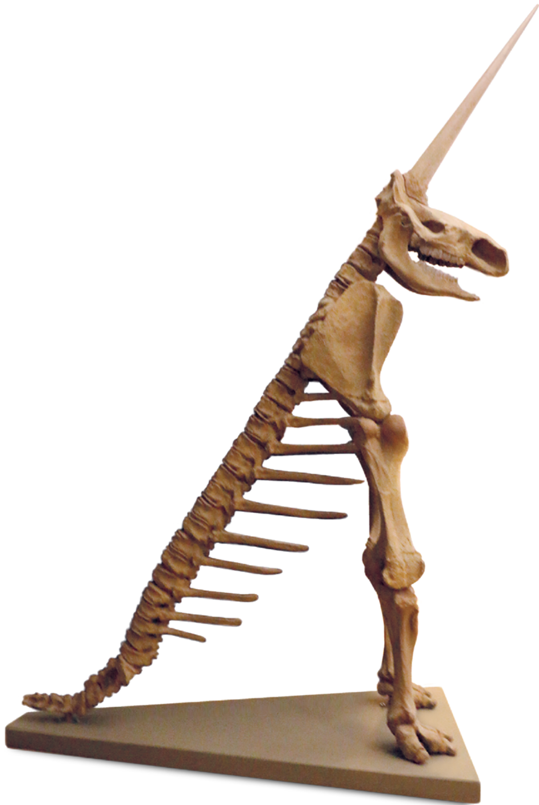
Fig. 2 3D model of the Guericke-Einhorn on display at the Museum für Naturkunde (Natural History Museum) in Magdeburg (Germany).