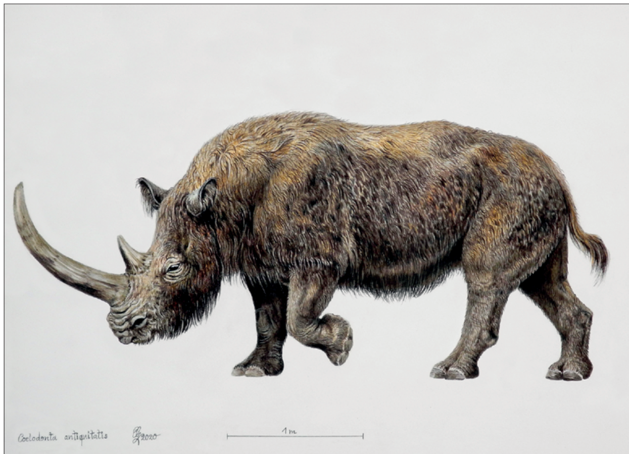
Fig. 4 The Woolly rhinoceros Coelodonta antiquitatis . – (Drawing: Elke Gröning).