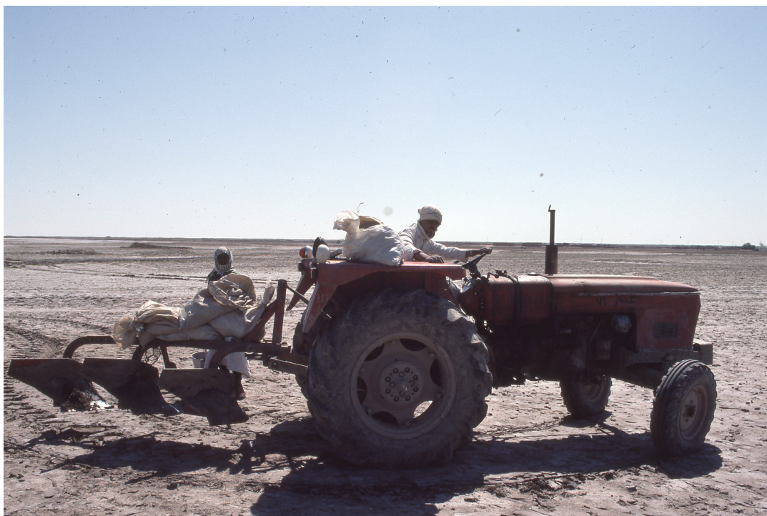
A new use for a plow, Abu Salabikh, 1987.