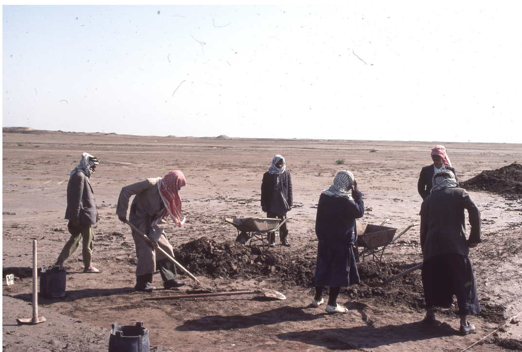
Iraqi fieldworkers using long-handled shovels and wheel barrows to remove the soil before surface scraping. Abu Salabikh, 1987.

Iraqi fieldworkers came from nearby villages to work with us. The bottom photograph was taken probably sometime in March when the weather could be windy and cool.