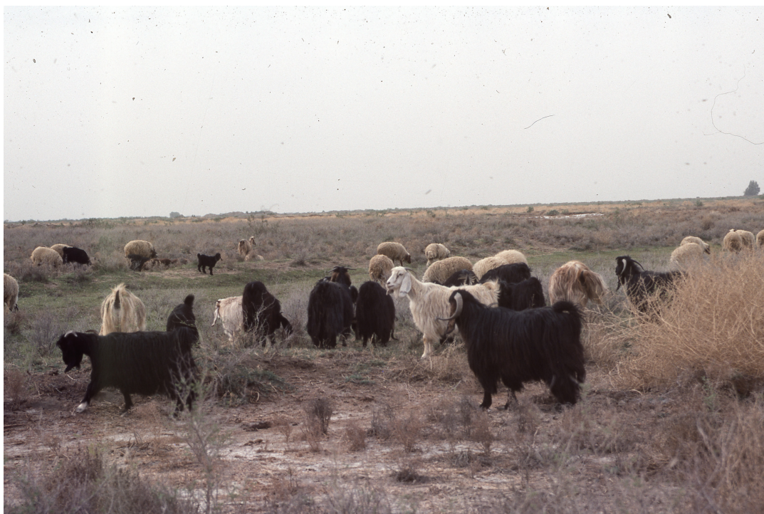
Sheep and goats grazing nearby, Abu Salabikh, 1987.