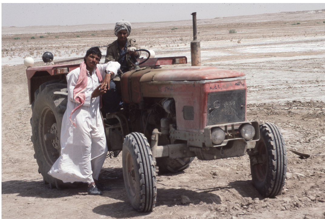
The tractor, Abu Salabikh, 1987.

A plow does double duty. The folks who worked with us from the nearby village of Abu Salabikh lent us the use of their tractor, not