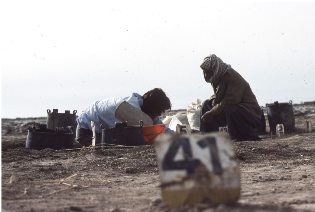
Me and Iraqi field assistant, Abu Salabikh, 1987.