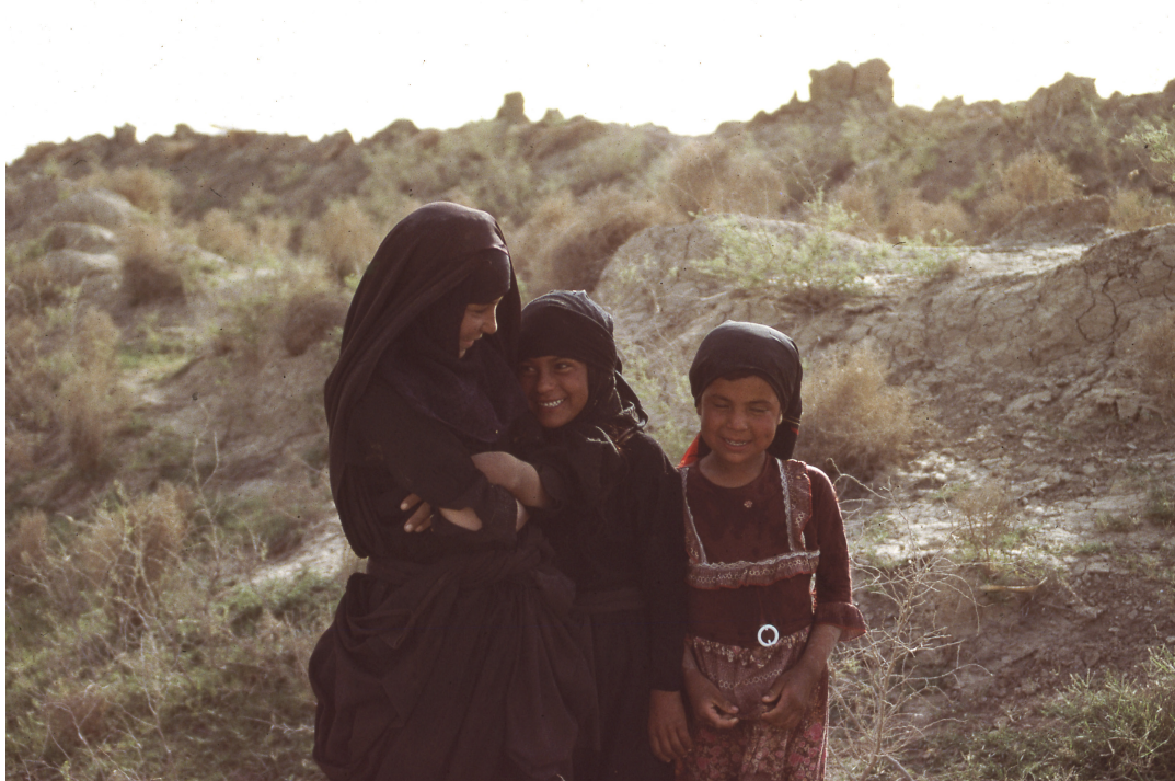
Iraqi girls from the village would often play on the outskirts of our camp. Abu Salabikh, 1987.