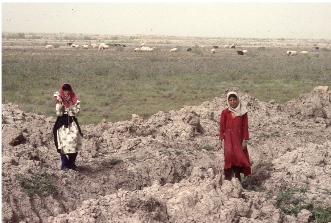
Young girls along the canal attending to a small flock of sheep in the background, Abu Salabikh, 1987.