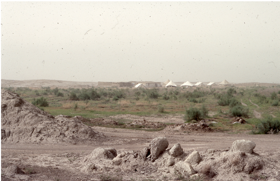
Field camp, Abu Salabikh, 1987.

I became an archaeologist in part because I like working outdoors and camping. I had a great time doing both at Abu Salabikh, plus I got the chance to work with some really great people. The first few days in camp each