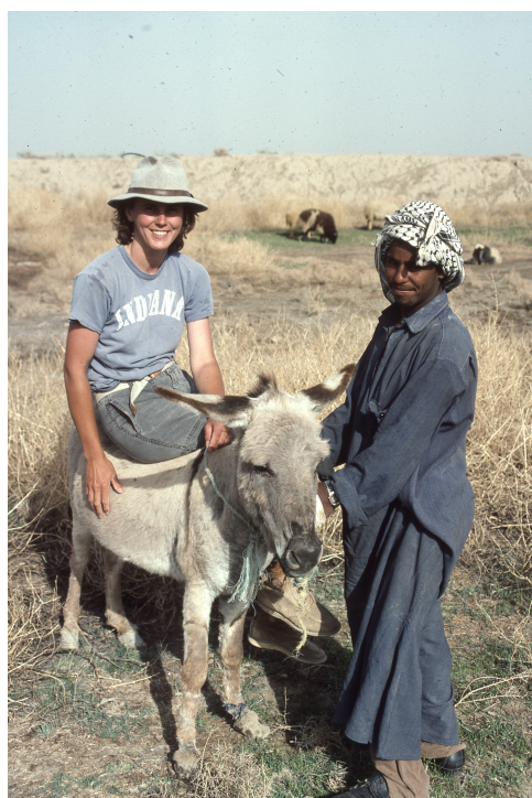
Having some fun out in the field, Abu Salabikh, 1987.