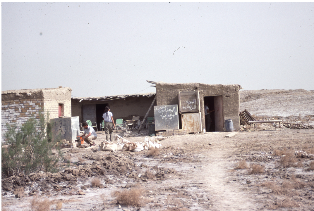
Field houses at Abu Salabikh, 1987.