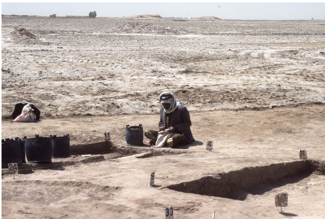
Iraqi fieldworker excavating, Abu Salabikh, 1987.