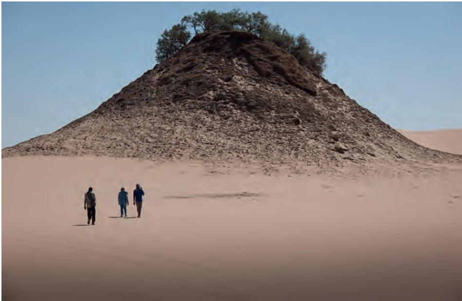
Fig. 3. Large tarbool with Tamarix aphylla shrub still growing on the top, supporting gradual accumulation of wind-transported sand and litter