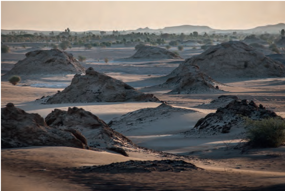
Fig. 1. Vegetation mound (tarbool) landscape of El-Ga'ab Depression (Um Hilal area). Most tarbools are dead and partly eroded ones

A field survey was conducted in El-Ga'ab area in May 2013, September 2014, and November 2015. Its main task was to record the presence, location and morphometrics of the tarbools. The plants that formed them were identified as Tamarix aphylla (Fig. 3). The structures of these mounds or hillocks were also analyzed. More than 80 individual hillocks were encountered and documented in El-Ga'ab area. The height of some mounds may reach 10 m with a maximum basal circum-