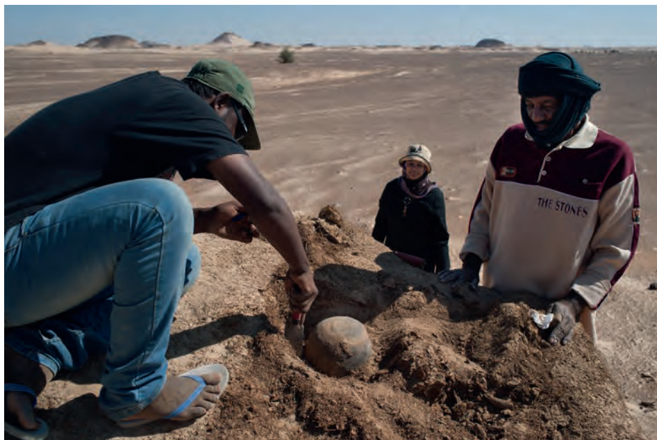
Fig. 5. Find of Early Islamic pottery (complete vessel) preserved in the interior of the tarbool

This site is located in a distance of about 36 km from the Nile. The coordinates, circumference and heights of the vegetation mounds were recorded. Five eroded mounds were selected for excavation. A vertical trench was made in the middle of one (heavily eroded) mound that is about 37 meters in diameter and three meters in high. Different remains were collected from different strata, such as animal droppings (presumably of camel), bones, pieces of pottery, and charcoal accumulations of herds (fire places). Some archaeologically important remains were encountered within the tarbool stratigraphies in Um Hilal area, such as pottery belonging to the Early Islamic period (Fig. 5). Numerous Christian and Early Islamic pottery was found and identified in the same area close to vegetation mounds. Fireplaces designed for accidental cooking which were noticeably located opposite to the wind direction (southern sides of the mounds, thus protected from northern winds). Samples for radiocarbon dating were collected from the interior of the mounds, where fireplaces with charcoal were encountered.