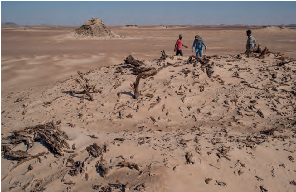
Fig. 4. Almost completely eroded tarbool displaying its internal structure full of organic remains