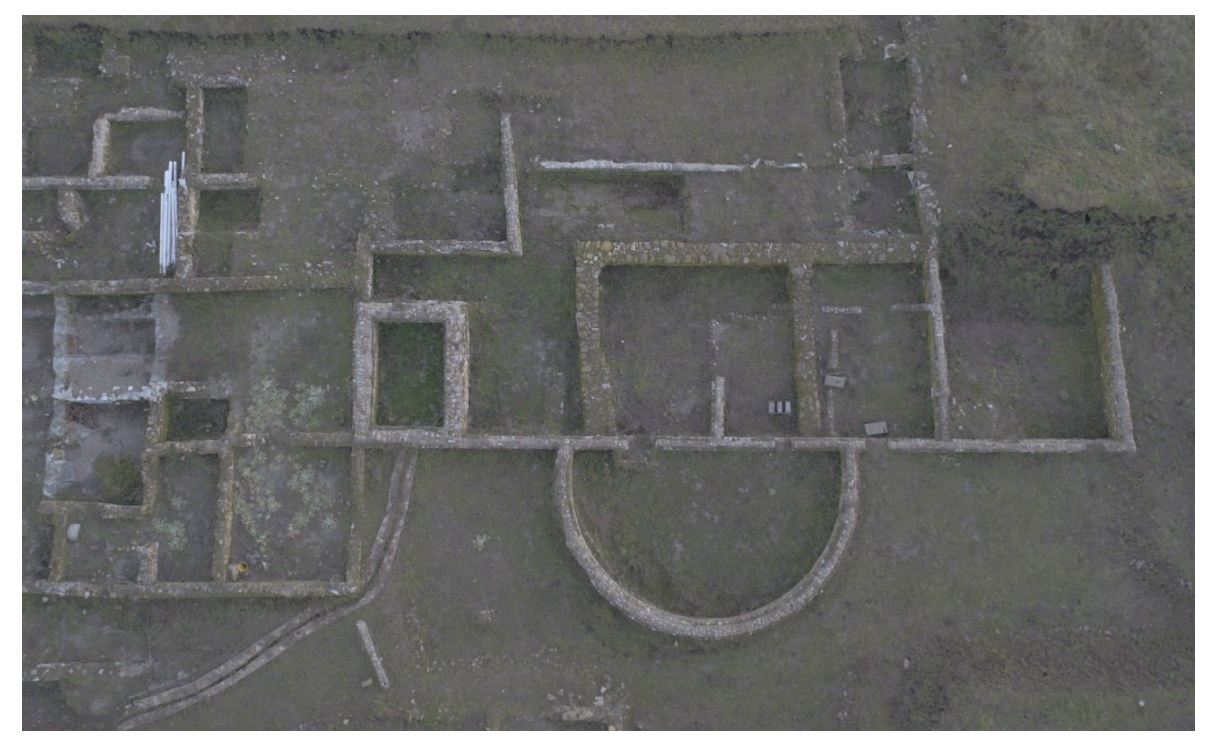
Fig. 1. Photo of a part of the Roman site.