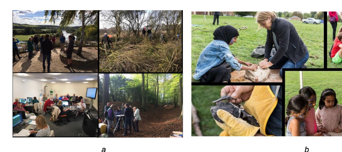
Fig. 2. variety of training events offered by the project: a) Guided site visits, invasive scrub clearance, GIS training, and topographic survey training. b) Residents of the Chilterns AONB enjoy an array of hands-on experiences at Pop-up Prehistory events.

As the Chilterns and its environs cover over 1000 km², the project has split the region into four zones and deliberately replicates most events at least four times to be certain there is parity across the entire area. There is an unfortunate tradition of London- and south-centric bias in engagement projects, which this approach helps to mitigate. Of course, no community archaeological project would be complete without a little digging in the dirt—there have been small scale targeted excavations led by trained professionals but open to completely inexperienced enthusiasts, who, under careful leadership and training, have successfully excavated and recorded prehistoric features relating to the hillforts.