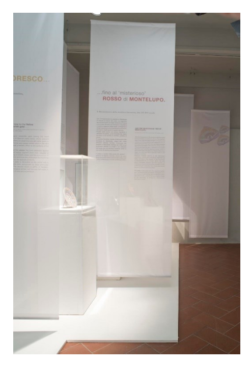
Fig. 4. The exhibition, ground floor