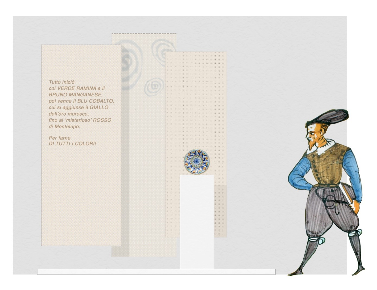
Fig. 2. Concept of the exhibition design (© Giada Cerri)