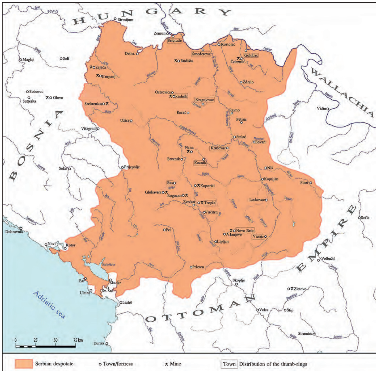
Fig. 3 Map showing the distribution of archers' rings in Medieval Serbia (14 th -15 th centuries). – (From Popović, Cosmopolitan Milieu fig. 88, mapping by U. Vojvodić).

thumb rings occurred during the 14 th to the middle of the 15 th centuries in different contexts 29 , including grave findings, thus suggesting a particular importance for the owner in life. Within the same chronological frame, the rings occurred in Medieval Serbia, where they were certainly used in the same way.