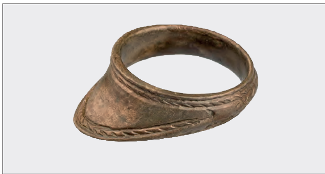
Fig. 9 Archer's ring from Rudnik, 14 th -15 th century. – (From Radičević/Bulić, Prilog , T. 5/4).

of the mining town of Rudnik (Central Serbia), a male was buried with an archer's ring (fig. 9). As such, it was an item that describes his hunting skills in a proper way. According to the grave position – in the western part of the nave – it is presumed that he was the founder and one of the benefactors of the church 45 . A similar funeral context is noted in a church at the site Postenje near Novi Pazar (southwest Serbia). A boy buried in a garment embroidered using golden and silver threads had an archer's ring on each hand (fig. 10); both rings are small, made to fit someone of his age, and made of silver, with one additionally being gold plated 46 . It should also be noted that one of the previously mentioned bone rings was positioned on the left side of the chest of the deceased 47 .