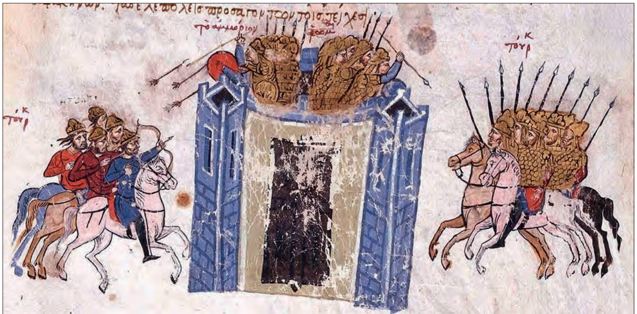
Fig. 2 The Siege of Amorium by the Arabs in 838. Illuminated manuscript of the History of John Skylitzes, 12 th century. – (© Biblioteca Nacional de Madrid, Vitr. 26-2, image no. 77, http://bdh-rd.bne.es/viewer.vm?pid=d-1754254 ).

well as SS Merkurios and Theodor 20 . In Medieval Serbia, these depictions – taken from Byzantine iconography – were especially popular during the reign of King Milutin (1282-1321), due to his offensive policy in the Balkans and expansion of the Serbian state to the south, at the expense of Byzantium 21 . Particular significance to the holy warriors was given in the paintings of the Morava school: in the Ravanica church – the endowment of Prince Lazar, built between 1376-1377 and 1380-1381 – sixteen of them are depicted 22 . The main reason for emphasising the significance of the holy warriors in the iconographic programme of the late 14 th century was the threat of Ottoman invasion, which became a reality after the battle of the Maritsa River in 1371.