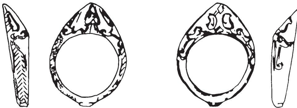
Fig. 10 Archer's ring from the site of the Latin Church in Postenje, 14 th -15 th century. – (From Premović-Aleksić, Latinska crkva , T. V/3, 4).