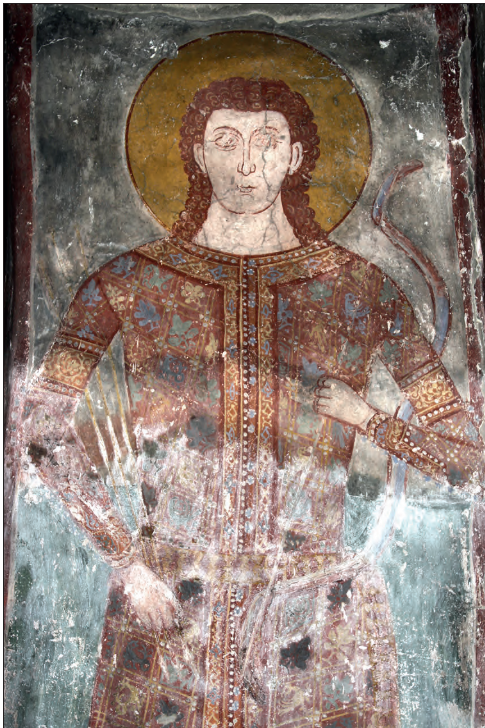
Fig. 8 Monastery Veluče (1377/78), portrait of young nobleman on the north wall of narthex. – (Photo M. Marković).

As one of four sons of the patron of the monastery, his high socio-economic status is represented by the lavish clothes that he wears 44 . In such a context, the four rings certainly indicate his superb archery skills. One can perhaps go a step further and recognise in such a depiction an aspect related to the