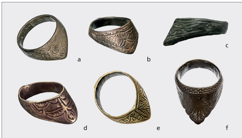
Fig. 5 Archers' rings from museum collections, 14 th -15 th centuries: a-b National Museum Kragujevac; c Belgrade City Museum (inv. no. I 2120); e-f Museum of Applied Art (inv. no. 164, 10184). – (© Documentations of National Museum Kragujevac, Belgrade City Museum, and Museum of Applied Art, Belgrade).