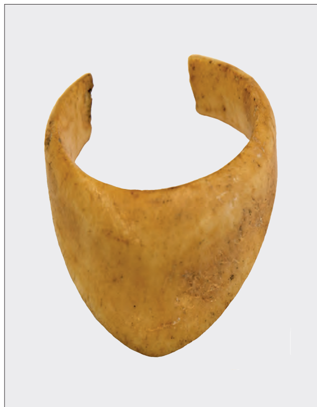
Fig. 4 Bone ring from the Belgrade fortress, 15 th century.

The simultaneous appearance of archers' rings in Byzantium and in the Balkan states of Serbia and Bulgaria, which inherited the Byzantine artistic expression, indicates a process of cultural transfer, which led to the adoption of models into art and artistic crafts. The composite decoration of these rings fully reflects the artistic patterns of that time: a unique mixture of motifs, containing the Byzantine decoration as a base, traditional in the region, which is refreshed with Islamic-Ottoman elements and Central European decoration, such as Gothic leaves and heraldic motifs. That is why it is very