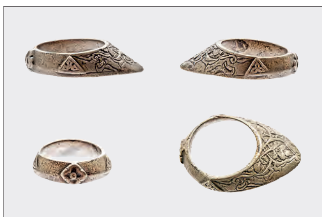
Fig. 6 Archer's ring from Golubac, Serbia, late 15 th century. Museum of Applied Art, Belgrade, inv. no. 4438.