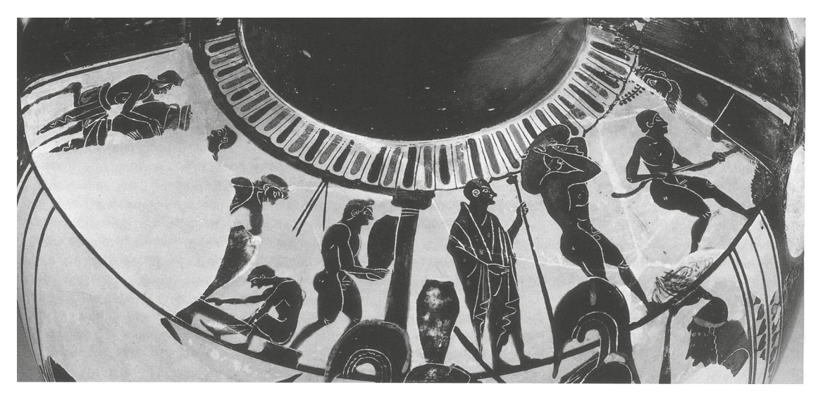
Fig. 2: Depiction of a potter's workshop. Hydria, Munich, Staatliche Antikensammlungen and Glyptothek 1717. Ca. 520–510 BC; Leagros Group.

Finally, the extensive series of production sites uncovered during rescue excavations in the Kerameikos cemetery near the Dipylon Gate and as far as the 'Plato's Academy', about 2 kilometers from the city walls, is indeed impressive, but perhaps not surprising when compared to similar extension of the relatively minor kerameikoi at Selinous or Lokroi Epizephyrii. Despite their large numbers, the excavated remains reveal little information regarding the organization of work and the scale of the output of individual Athenian workshops producing figured pottery. Moreover, the scale and organization of production as a whole, though probably quite large, remains hard to assess.<sup>9</sup>