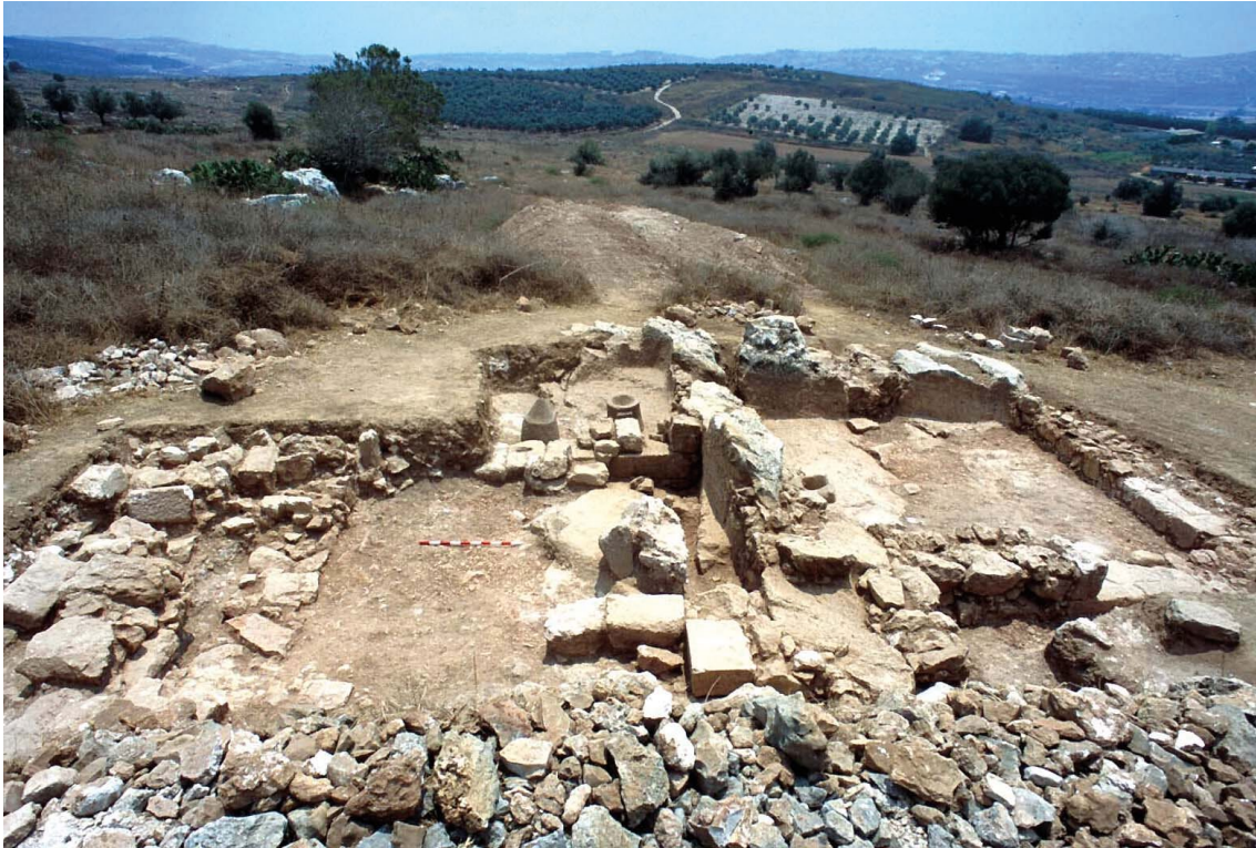
Fig. 5: Overview of the eastern rooms of the farmhouse located east of the site and south of the road running westward into the Lower City.

along Nahal Zippori, some distance from the spring, and were indeed associated with the extensive agriculture that was once an important source of livelihood for the city. 25