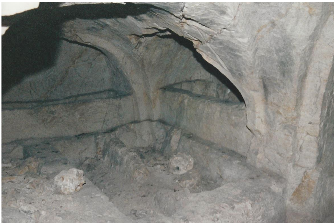
Fig. 3: Chamber with arcosolia containing several trough graves inside a larger catacomb in the eastern necropolis at Sepphoris.

elements executed in low relief adorn the interior of some tombs or decorate several sarcophagi, and two marble tombstones feature a Jewish symbol, either a palm tree or a menorah. 19