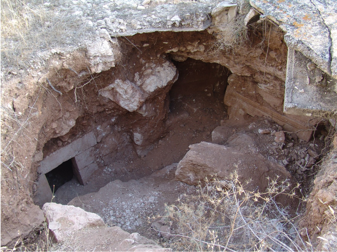
Fig. 4: Large catacomb with three burial chambers around a square courtyard in Sephphoris's southwestern necropolis.

quarried. In fact, one quarry was detected in the excavations conducted west of the summit, but it seems that most of the quarries used in Roman times were located outside the built-up areas and close to the necropolis. 22 One such quarry lies east of the site and north of the road leading into the city, more or less opposite the subterranean reservoir, and two others were uncovered in the southern necropolis located in the center of Moshav Zippori. 23