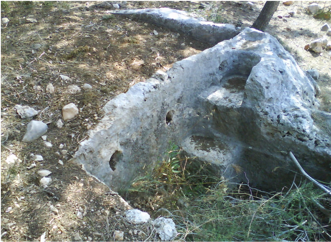
Fig. 6: A winepress in the farmhouse located southwest of Sepphoris.