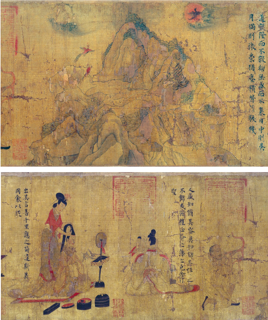
Fig. 2: Scene 6 (above and continuing below, right), 'The mountain and hunter'; scene 7 (below, left): 'The toilette scene'. Detail of the Admonitions scroll.

BCE); scenes 6–11 illustrate abstract principles and values; the final scene is the 'autobiographic' conclusion, as noted, the visual counterpart of a literary convention. The painter, historically taken to be Gu Kaizhi, likewise assumed this quasi-autobiographic voice, arrogating to himself as it were the role of presenting Zhang Hua's text, written in the persona of the warden of the harem, to his