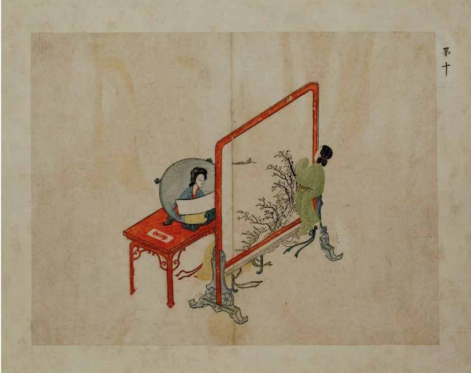
Fig. 5: Scene 10, Oriole reading a letter. From Min Qiji, Romance of the Western Wing , dated 1640. Six-colour woodblock-printed album, each leaf 25.5 x 32.2.

reads yuanyang 鴛鴦 or mandarin duck and drake, symbols of marital fidelity. Observe how these two characters are not featured one above the other (traditionally, writing was inscribed vertically from top to bottom, right to left) but tail-to-tail, as it were, to portend a pair of ducks coupled, a figure of the content of student Zhang's letter to Oriole. Otherwise in this scene, however, these two young people are represented as separated by the screen. She sits alone in her boudoir on one side, while he is depicted as the lone fisherman in a watery landscape on the other, an echo of the genre of palace poems about the lonely woman waiting up fretfully for her lover on one hand, and of the scholar who can turn his hand to ineffable, conceptual landscape painting as a form of self-cultivation on the other.