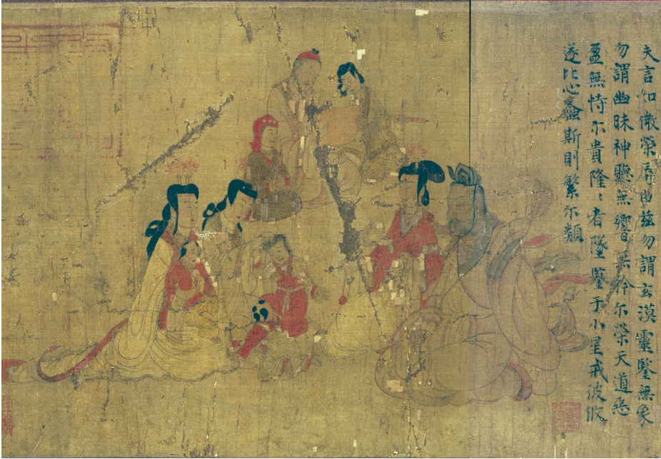
Fig. 3: Scene 9, 'The family scene'. Detail of the Admonitions scroll.

is about ensuring the harmony, stability and greatness of the royal family through the modest and retiring yet nimble conduct of the women. 'Do not rely on your nobility for the loftiest must fall' and 'model yourself on the smaller stars which avoid going far', the admonition declares. The women of the harem are, in effect, being warned not to aggrandize themselves by monopolizing the emperor's favour but to conform to court practice on receiving this, a domestic system governed by a rota keyed to his sun-like and their moon-like cycles for the procreation of multiple imperial offspring. They are told: 'Liken your hearts to the bush-cricket and so multiply your kind'.