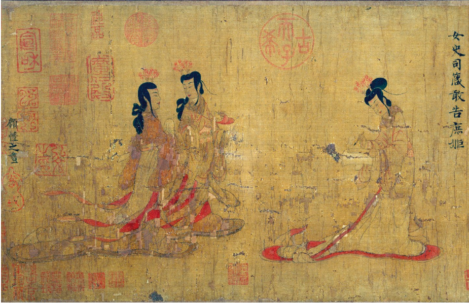
Fig. 1: Scene 12, 'The instructress'. Attributed to Gu Kaizhi (c. 344–c. 406; a probable 5th–6th c. copy), Admonitions of the Court Instructress picture-scroll. Detail of a former handscroll, mounted on a panel; ink and colours on silk, 348,5 x 25.0 cm.

moment as by a finger resting on a hair-trigger. It is worth noting that the tomb of the First Emperor of Qin (r. 221–210 BCE), the ruler who first unified China under a single if short-lived dynasty (Qin, from which the early modern word China) in 221 BCE ushering in the dynastic period that lasted up to 1911, is a pyramid-shaped mound. As this is not yet excavated, readers may be more familiar with the 6,000 strong terracotta army discovered in one of the satellite pits in the vicinity of the tumulus. Neither Zhang Hua's memorial text of 292 nor the painted illustration of it in the eponymous scroll, which may date to one or two centuries later, represent, in my view, any form of parody of historical exemplars or virtuous conduct but embody deeply self-conscious and often witty and urbane reflections on prevailing values and conduct at court in the medieval period. 12