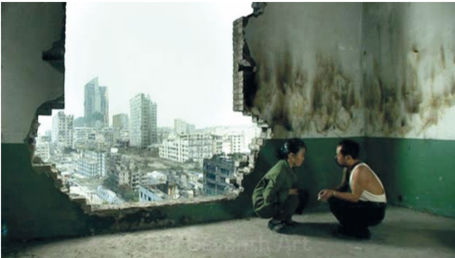
Fig. 8: During Sanming's reunion a distant building crumbles to the ground. From Still Life (feature film, 2006). Dir. Jia Zhangke.

The cinematography employs elaborate framings throughout, as is becoming clear. Another example is at a moment toward the end of the film where Sanming and his estranged wife are briefly reunited. The camera is still, and there is little dialogue, throughout the scene of their meeting, which takes place in the shell of a building prepared for demolition. There are two main frames within picture frame and the action shifts between them ( Fig. 8 ). The couple meet, silhouetted against the square wall to the right. Then, seen through the large hole of the broken window to the left, a distant building crumbles to the ground. They watch but from within their frame (as we do from within ours): there is a short story (the crumbling of a distant building) which is enacted or bubbles up and then disappears within their story, which takes place with the framework of the film (with its multiple story-lines), which itself implies further frames outside it that are no more or less real than what we experience here. Not long after the crumbling of the building, the reunion scene is over. In the epic national context of development and progress, the lives of actual people (the film featured many first-time actors, including Sanming, rather than professionals) exhibit suffering from anxiety, separation and alienation.