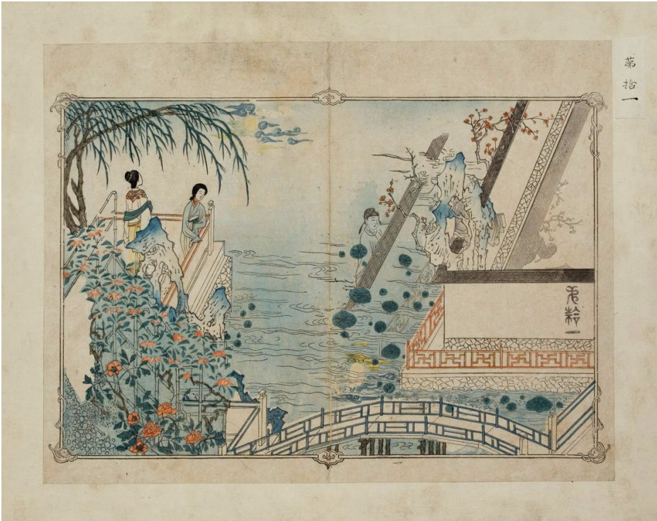
Fig. 6: Scene 11, Student Zhang climbing a wall. From Min Qiji, Romance of the Western Wing , dated 1640. Six-colour woodblock-printed album, each leaf 25.5 x 32.2.

climbing over the wall behind the rock with the support of a flowering plum tree (ironically, another traditional symbol of his scholarly credentials), to get closer to Yingying who is inaccessible in her quarters to the left. In an age that delighted in the trope of irony, it is not surprising to see the characters variously depicted as puppets (scene 19) or else as puppet-like figures in hanging lanterns. In the puppet theatre in scene 19, some characters not in use hang to one side, looking on powerless (left) as the active characters are being manipulated (centre). Still, this is not without humour: here is the scene where a shady cousin is plotting to marry the beautiful Oriole by claiming that student Zhang, recently ranked top in the capital civil service exam, has spurned her for another. Notice how the cousin's hand is louchely held out as if he were stroking the rock seen behind him on the wall. A joking figure for his misshapen priapic state, this rock points up towards the flowers, representing Oriole, which are featured appropriately in intaglio on the roof above. There is a degree of complicity with the audience here, in the suggestion that self-stimulation is as far as this interloper will advance in his marriage suit with Oriole.