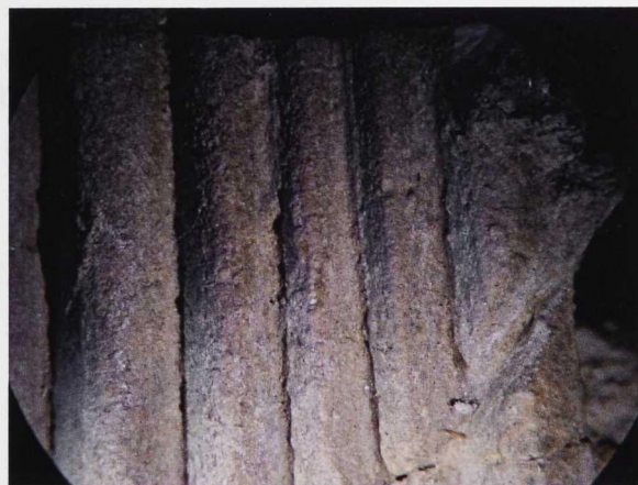
Fig. 8. Kadero Grave no. 244. Microscopic photograph of hippopotamus bone object – surface without use-traces. Magnification 20x.

The smaller elongated bone object (F), oval in section, has concave incisions and small depressions at the dorsal surface around the perforated hole (Fig. 3). This suggests that it was suspended on a strap or string. Due to the bad state of preservation it was not possible to identify any traces of use.