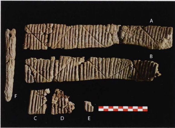
Fig. 3. Kadero. Object of hippopotamus bone found in grave no. 244

As the find is unusual for all the Khartoum Neolithic, detailed microwear and functional studies were carried out. The bone objects were the subject of traseological observation with the help of stereoscopic microscope Olympus SZX9, with a magnification ranging from 6.3 to 57x. All the finds were well preserved however the previous conservation sometimes made microscopic observation difficult.