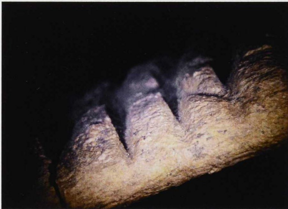
Fig. 4. Kadero. Grave no. 244. Microscopic photograph of hippopotamus bone object – side profile. Magnification 20 x.

As the find is unusual for all the Khartoum Neolithic, detailed microwear and functional studies were carried out. The bone objects were the subject of traseological observation with the help of stereoscopic microscope Olympus SZX9, with a magnification ranging from 6.3 to 57x. All the finds were well preserved however the previous conservation sometimes made microscopic observation difficult.