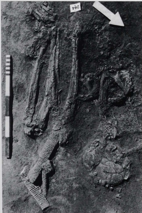
Fig. 1. Kadero. Grave no. 244

In the 2001 season a grave of an adult man related to the Neolithic stage of the site occupation was discovered (Krzyżaniak 2002; Witas et al. 2002; A. Krzyżaniak, this volume). The rich inventory of the inhumation (grave No. 244), indicates an important status of the deceased within the