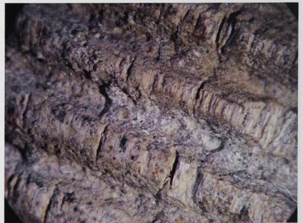
Fig. 6. Kadero. Grave no. 244. Microscopic photograph of hippopotamus bone object – surface with use-traces. Magnification 20x

quency of these traces is different not only on one object (A) but also when comparing it to object B (the larger object has more of such traces). Most probably these traces are the result of rubbing the object with a tool made of hard material. Similar surface modifications, including zigzag pattern