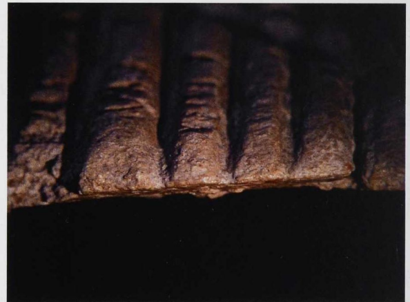
Fig. 5. Kadero. Grave no. 244. Microscopic photograph of hippopotamus bone object – side profile. Magnification 20x.

to differences of the thickness of the rib itself, the state of preservation and possibly due to usage (Fig. 5, 6). On the raised surfaces in between the parallel cuts, tiny breaks, traits and striations parallel to the long sides of ribs can be observed, which are not visible within the interior of the concave cuts (Fig. 7). The distribution and fre-