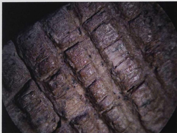
Fig. 7. Kadero. Grave no. 244. Microscopic photograph of hippopotamus bone object – surface with use-traces. Magnification 20x.