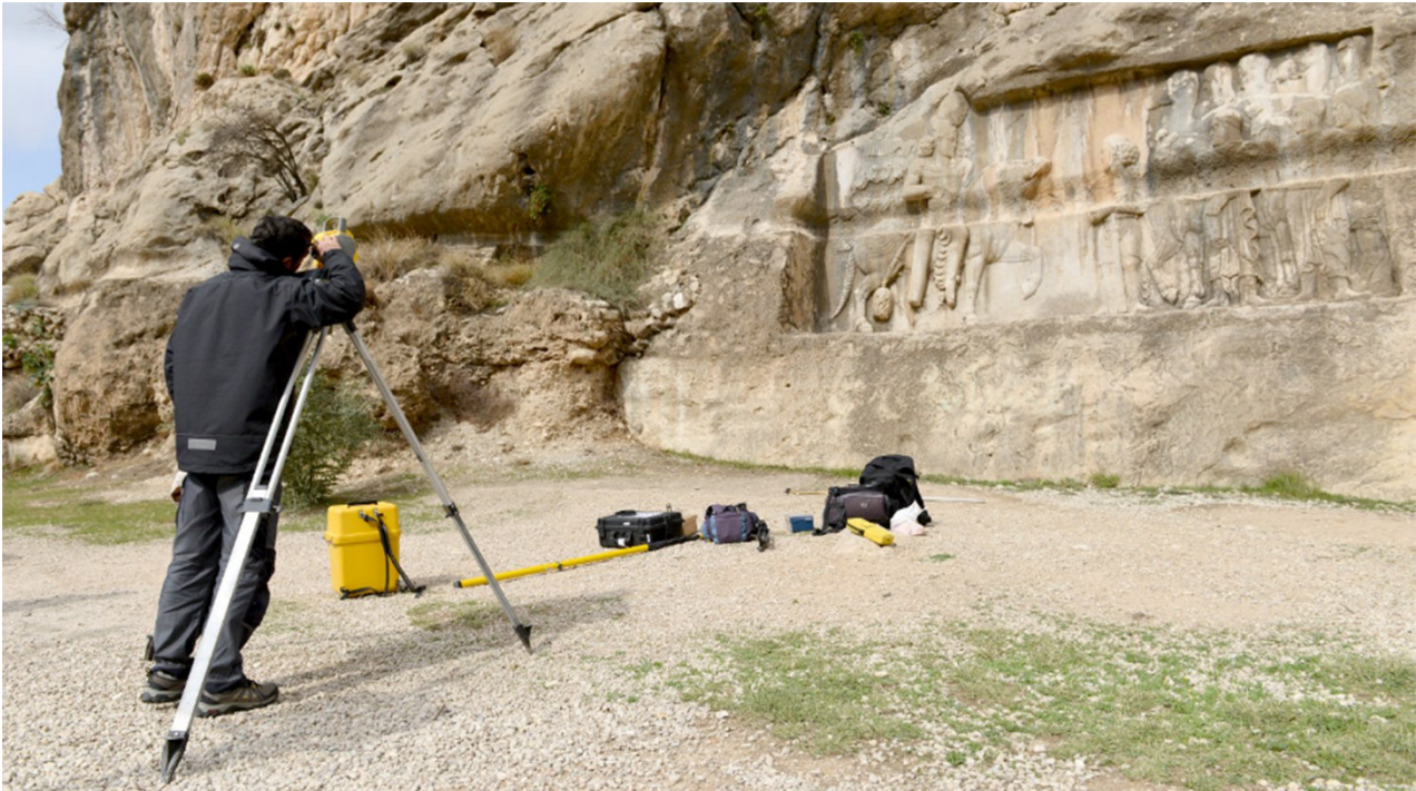
Fig. 2. Documentation of Sasanian Rock Reliefs (© R. Gietl).

The DADIM Team has been conducting fieldwork since 2015; so far, we have been concentrated on the Sasanian period, covering the extensive area of Firouzabad in the province Fars. From 2015 until 2019, we extended the documentation areas over the provinces in South-, Northern and Western and Northwest-Iran. In this context, the Sasanian Rock Reliefs have been photogrammetrically documented (Figure 2). The detailed observations from the recording and data evaluation have provided new insights, which form the basis for future research in the field of digital cultural heritage as well as in history and archaeology.