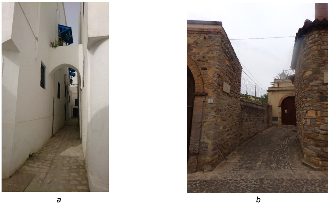
Fig. 1. The impasse a) In the medina of Tunis, Tunisia; b) In the city of Sardara, Sardinia.

opment of similar structures of protection and trade. This work aims to study through a multidisciplinary approach, the physical forms of urban space, its uses and the perception of its users, the characteristic morphologies, and typologies in a circumscribed geographical context. (Figure 1)