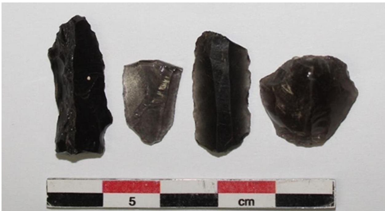
Fig. 1. Obsidian artefacts from Early Holocene Cyprus.

Despite recent mounting evidence demonstrating the successful early exploitation of insular environments around the globe as far back as 100 ka, the island of Cyprus is still persistently regarded as isolated from regional phenomena and largely unaffected by them. The main reason behind this marginality view is the island's insularity and geographic location at the periphery of the continent. Following a Terminal Pleistocene occupation, the Early Holocene signals the first permanent settlements on the island dating to around 10 ka and followed by a settlement expansion in the Middle Holocene (ca. 8 ka). The traditional view of Cyprus regards these early settlements as the outcome of Neolithic farmers who arrived from the mainland and subsequently turned their backs to the continent developing in isolation because of the presumed sea barriers prohibiting communication.