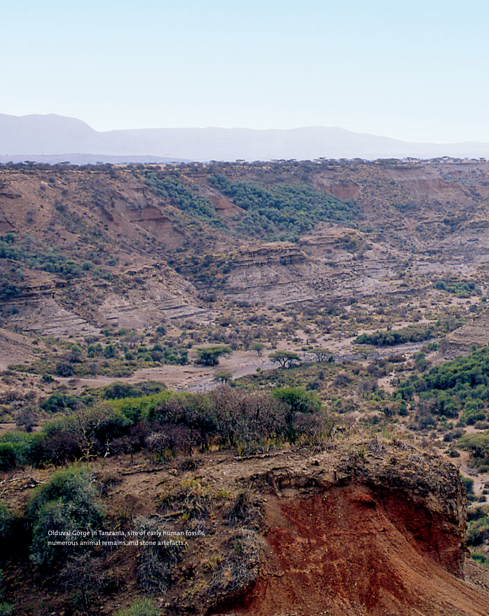
Olduvai Gorge in Tanzania, site of early human fossils, numerous animal remains and stone artefacts.