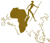
THE ROLE OF CULTURE IN EARLY EXPANSIONS OF HUMANS