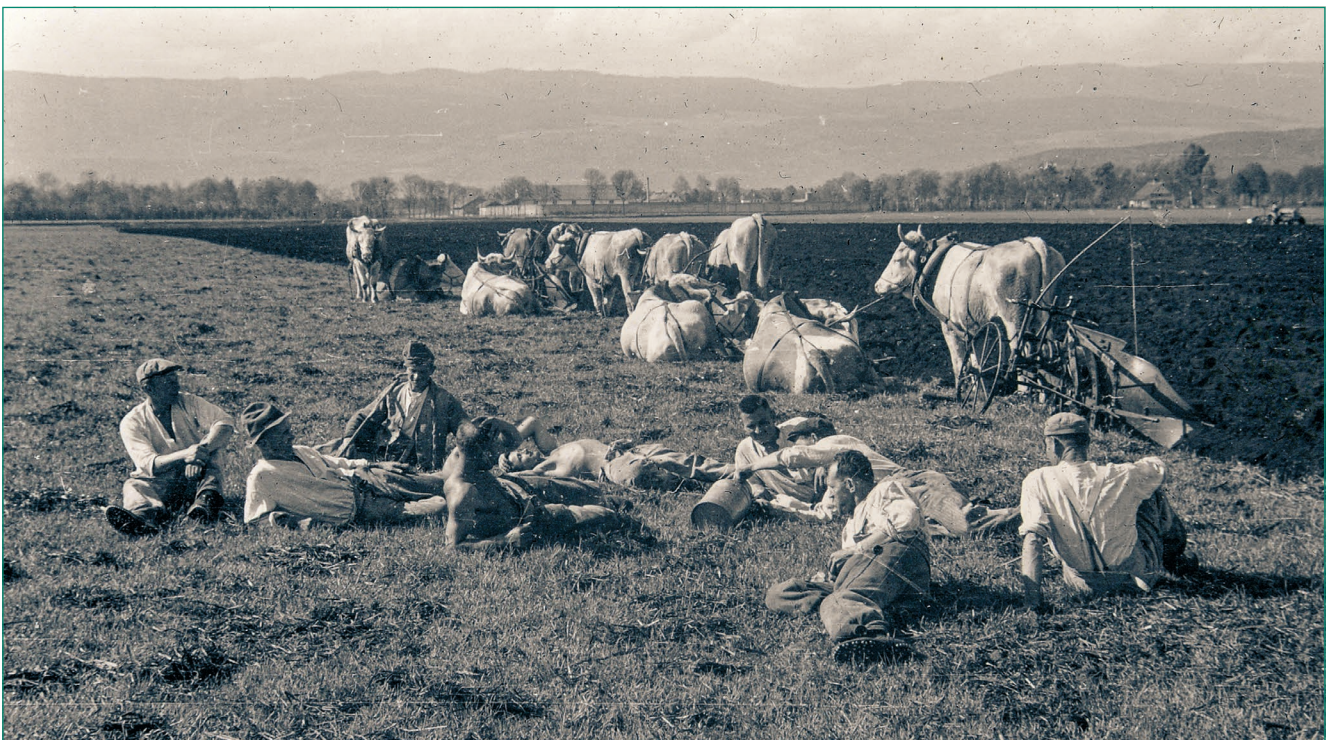
Figure 7 – Oxen and men could not work continuously, they had to rest, eat and drink periodically