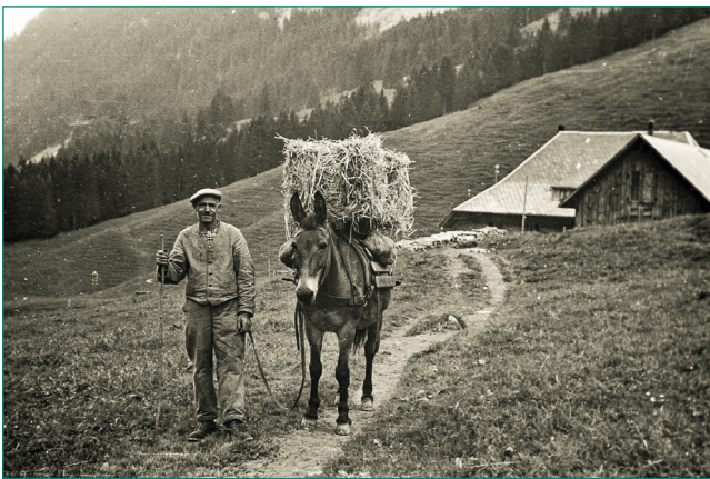
Figure 2 – Mules were indispensable for carrying loads in mountain areas

Donkeys and mules were efficient, frugal and cheap working animals for many who couldn't afford horses. They served as riding, pack and draft animals. As so-called pack mules, they were able to carry heavier loads in relation to their weight than horses, cattle or camels. Donkeys were important and numerous around the Mediterranean, in northern Africa, in the Middle East, across Central Asia to China and in southern European countries such as Greece, Spain and Italy. In Europe, their distribution decreased from south to north. Deviating from this, in the first decades of the 19th century Ireland developed into a country whose density of donkeys per capita was roughly between that of Greece and Spain.