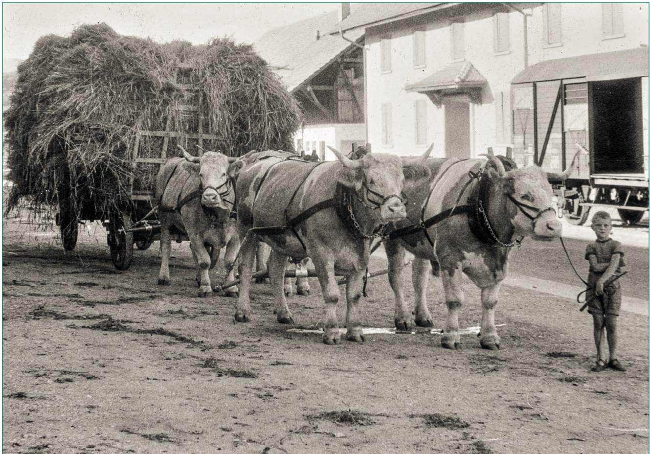
Figure 8 – Children and animals often worked together

Recreation is another field where close interactions between men and animals can be observed. Both, men and animals get tired when they are working. Unlike motor-driven machines they are not able to work continually, without resting. As living resources, they have to eat and drink regularly. When men and animals were working together, they often rested, ate and drank together.