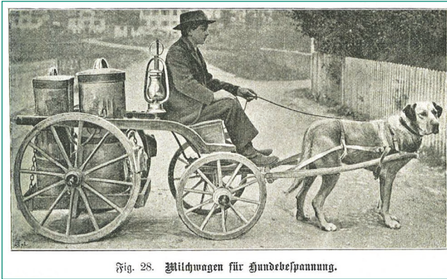
Fig. 28. Milchwagen für Hundebespannung.