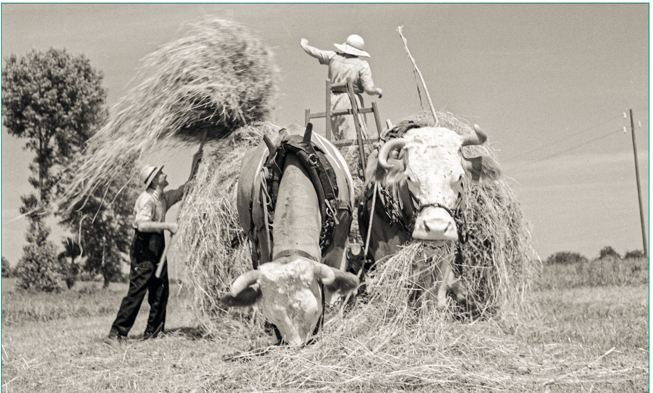
Figure 3 – In many European regions, cows were the most numerous draft animals up to the middle of the 20th century