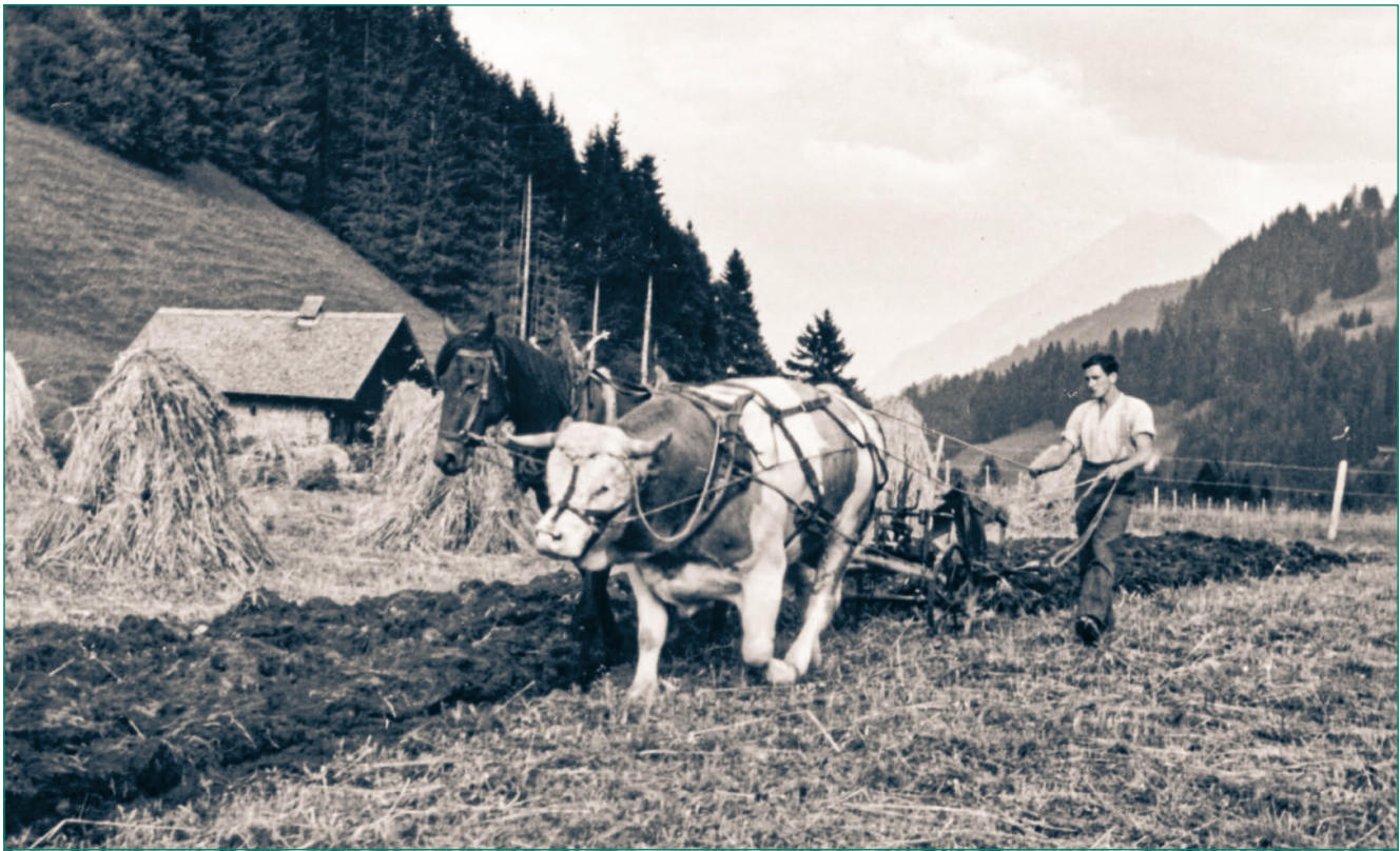
Figure 4 – Breeding bulls were used, often in cooperation with horses, oxen or cows, as draft animals too

and draft performance, they normally were harnessed for a few hours per day only. And before and after giving birth to a calf they usually were spared from draft work altogether.