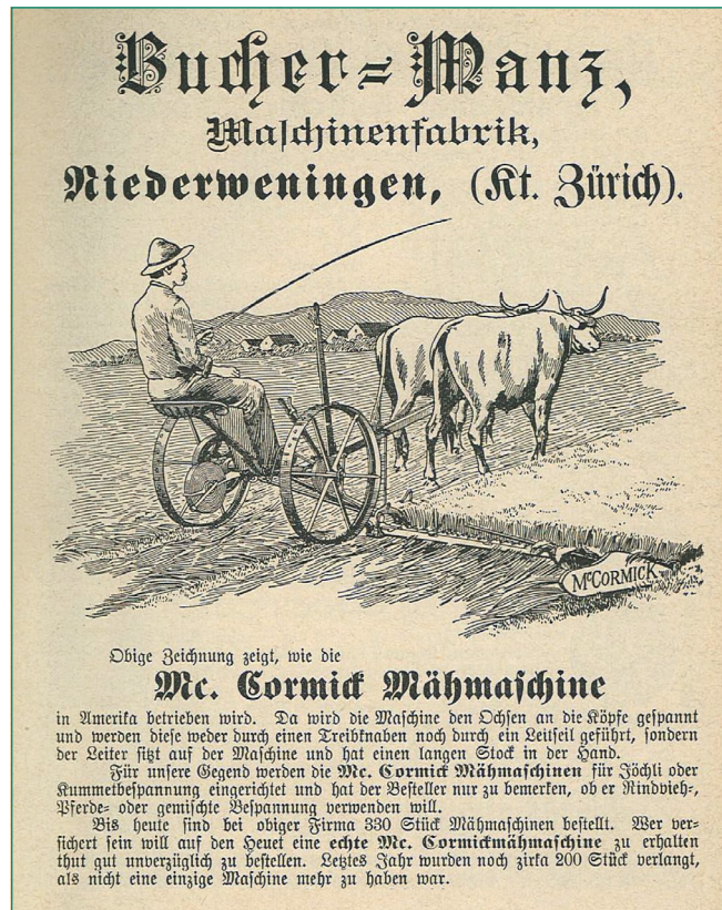
Figure 1 – Even in North America mowing machines often were powered by oxen up to the First World War

In agricultural production, working horses remained indispensable up to the middle of the 20th century. Because the cultivation of plants depends on the weather, the topography and the soil structure, it took more than half a century to turn the strong, but clumsy and far too heavy steam-power machines of the 19th century into light, versatile, motor-driven machines, which were able to compete with animal power. In North America steam ploughs were successfully implemented for breaking