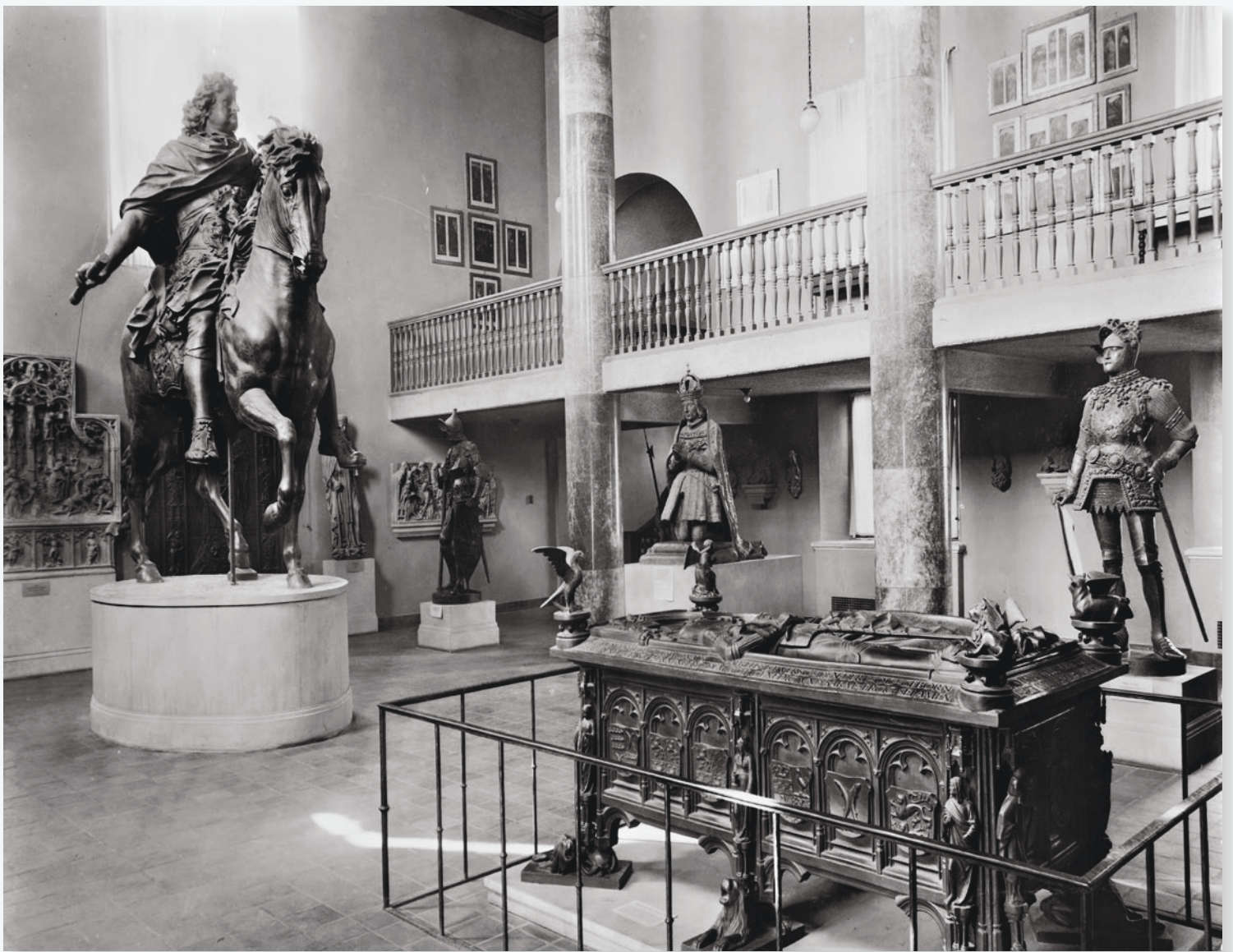
Figure 5 Interior view of Renaissance Hall, Adolphus Busch Hall, 1928