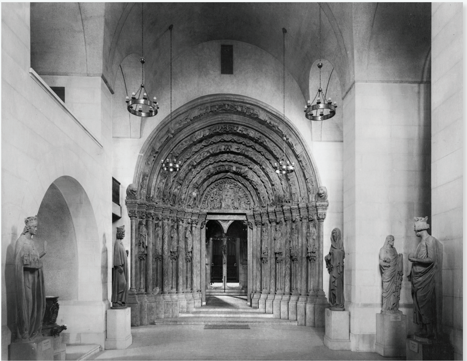
Figure 4 Interior view of Romanesque Hall, Adolphus Busch Hall, prior to 1931