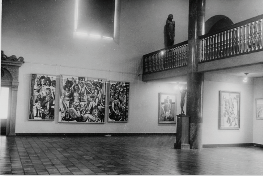
Figure 6 'Max Beckmann' exhibition, Germanic Museum, Adolphus Busch Hall, 1949