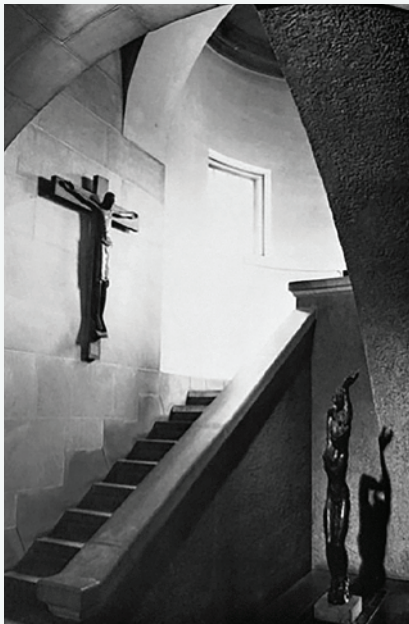
Figure 8 Interior view, Adolphus Busch Hall, after 1959