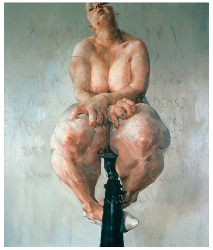
Fig. 11: Jenny Saville, Propped, 1992

status with her radically de-idealised monumental representations of female nudes. In the autumn of 2018, Saville's nude self-portrait Propped (1992) sold at Sotheby's London auction for a record-breaking price of 9.5 million pounds, or roughly 11 million euros, rendering her »the world's most expensive living female artist.«<sup>8</sup>