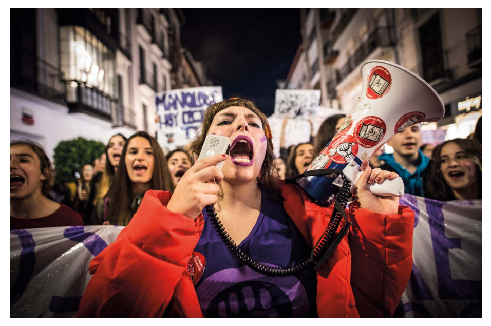
Fig. 8: Demonstration in Granada, 8 March 2018