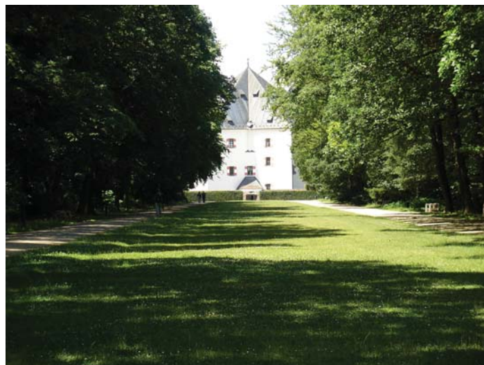
Fig. 2 The hunting lodge of Stern.

By building 'Stern' in a game reserve on the White Mountain some six kilometres from Prague Castle, the Archduke started, and with great diligence also finished, an undertaking representative for the Habsburgs. The game reserve was (and still is) enclosed by high walls and gates. Stern could in the middle of the sixteenth century be reached by way of a road fringed with trees. The building itself lies at the end of an avenue, just at the slope of the mountain. Therefore and because of the enclosing walls around it, Stern does not seem to be exactly monumental. But a visit will have impressed the visitor in the sixteenth century, as it still does today (fig. 2).