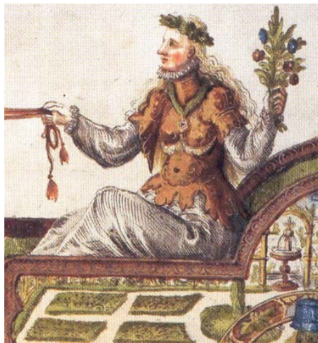
Fig. 6 'Goddess' with mask and blonde wig (detail from fig. 4).