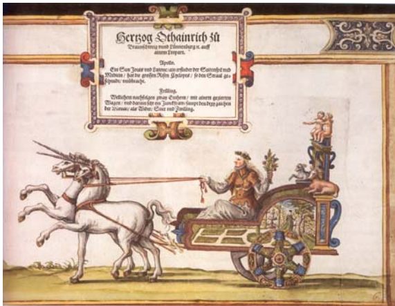
Fig. 4 Sigmund Elsässer, ‘Spring’.

There are no images of these literally explosive expressions of imperial representation held on 9 November 1558. But there are, thanks to the Archduke himself, images of meetings of lesser status. Reports on tournaments are illustrated in a ‘Turnierbuch’ . 37 And there are images in a wonderful record by one of the spectators of the festivities at the so-called ‘Kolowrat Hochzeit’ . 38 Although Ferdinand II himself was never the central figure – the bridegroom – in an official Habsburg wedding in Prague, he certainly was the director of several others. 39 The Archduke seems to have been actively involved in and present at all parts of the programme. His role at a wedding party in 1555 can be reconstructed on the basis of a fairly detailed report.