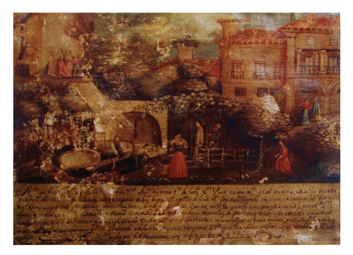
Fig. 3 The Palace of Salvaterra de Magos in the 1740s (detail from an ex voto painting)

In 1589, D. Philip I disposed of an annual budget of 80,000 for architectural building and gardening maintenance, which was later confirmed in 1595. In 1581 the choice fell on the palace gardener Rodrigo Álvares, the Portuguese disciple of the royal gardener the Italian Jerónimo de Algora, who worked at the palatine gardens of Aranjuez.<sup>74</sup> However, the character of the monarch's intervention is not known because the building was later rebuilt after the earthquake of 1755. Now all that remains of the original building is the royal chapel, where we can be sure that the king prayed.