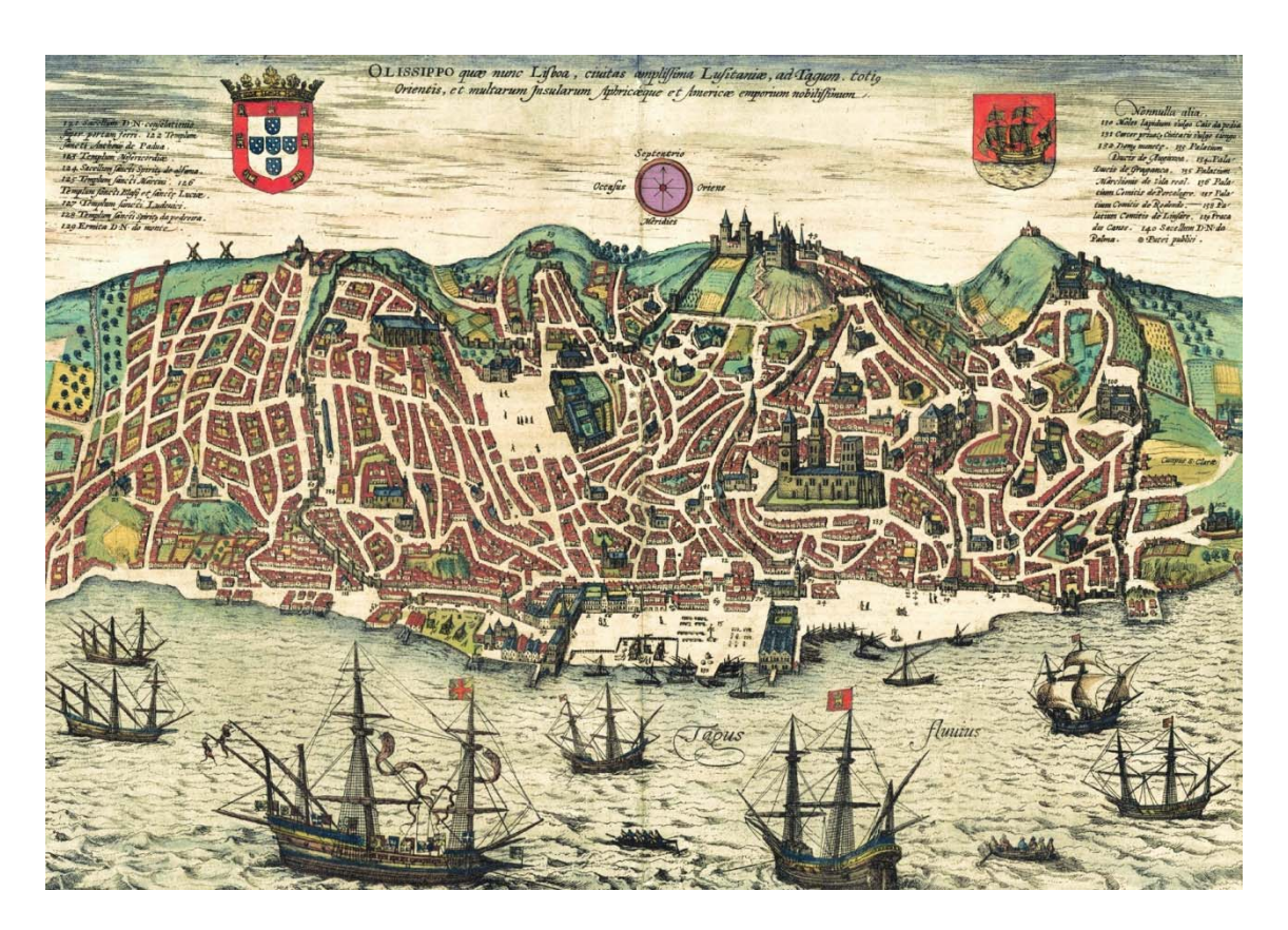
Fig. 1 Lisbon in 1572 with the River Palace (below) and the Alcazar Palace (above)

public and private palatine dependencies. Once more, art patronage would become vital to emphasizing the political project of repraesentatio majestatis and so to reinforcing adherence to the Spanish Habsburg monarchy on these regions on the edge of the Atlantic.