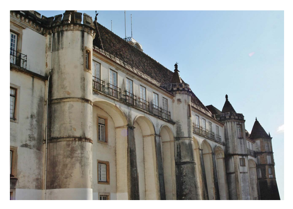
Fig. 4 The Alcazar of Coimbra in the 16th century (detail of the north façade)