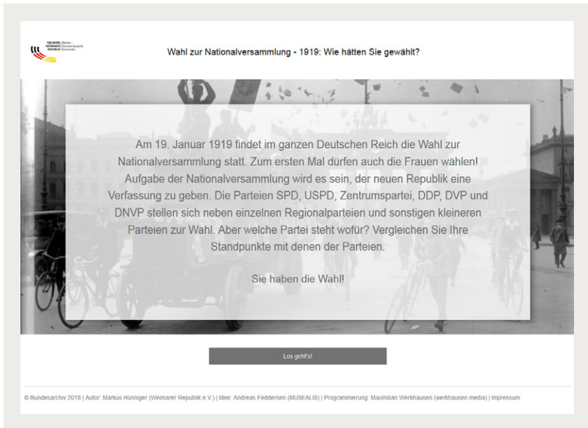
Fig. 2: Detail of the Election Compass 1919.