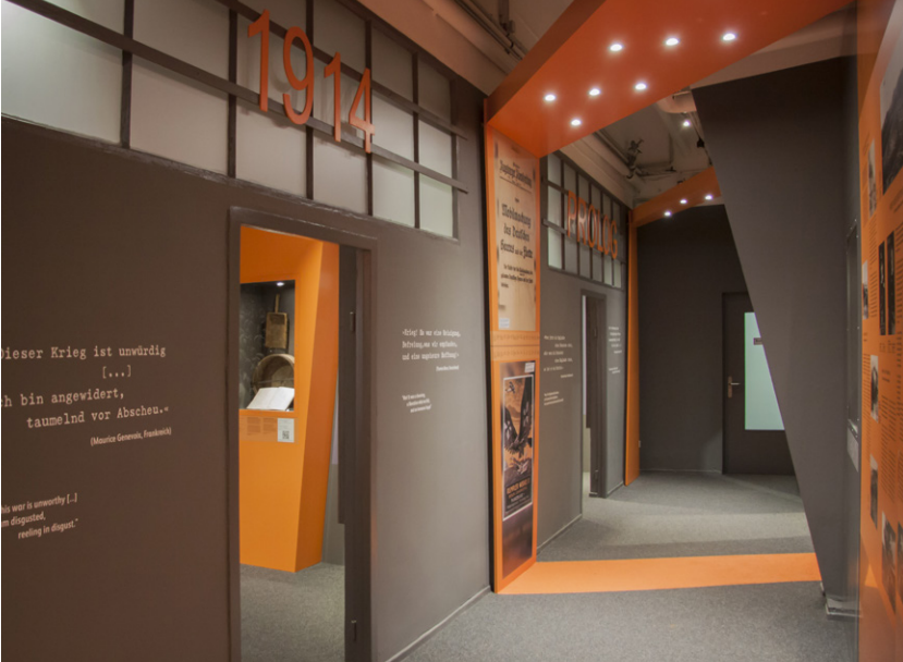
Fig. 2: Exhibition space. 3PIW: Falkenstein 1914 and Ralf Heldenmaier. MHM Gatow CC-BY-SA, by kind permission of MHM Gatow, 2014

With 205,000 individual visitors and almost 7.5 million hits on the website in 2018 alone, the online project exceeded all expectations on a statistical level. But more importantly, manifold responses by an interested public, especially students and teachers who were using the website as resource in class, have also shown that 3PIW was able to address its readers on a personal level.