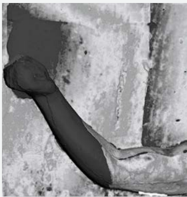
Figure 4 Parthenon west frieze panel XII, image of Elgin cast overlaid with 3D data from original

Dark grey areas show sections with the greatest deviation between original and cast. Note the seam lines and rectangular area around the hand.