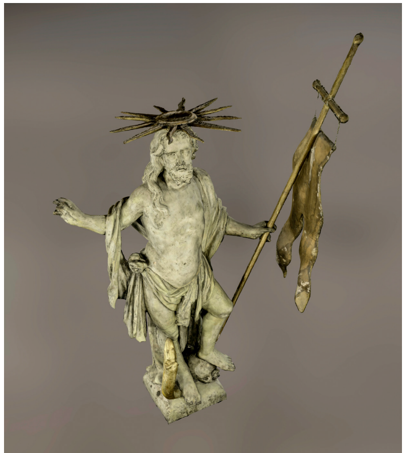
Fig. 5: 3D model of the figure of Christ by Christian Ackermann (2018).

So far, the close co-operation between conservation research and science has been presented, but how about art? Does artistic creativity have a place in our projects?