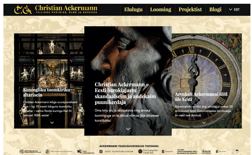
Fig. 2: Screenshot of the webpage of the project Christian Ackermann: Tallinn's Phidias – Arrogant and Talented (2019).

co-operation has been mutually beneficial.