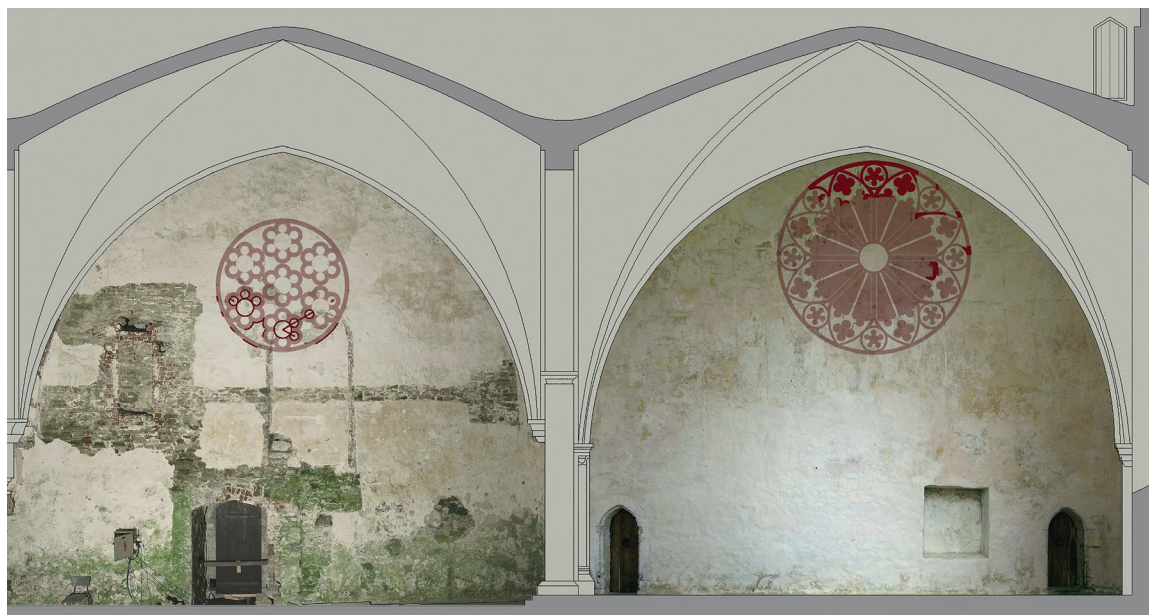
Fig. 6: Digital reconstruction of the painted rose windows in Põide church (2017).

After all, the Department of Cultural Heritage and Conservation is part of the Estonian Academy of Arts and this has yielded a different kind of synergy. Our research projects have inspired new creative actions. Actually, the Christian Ackermann project grew out of a joint art project of students of interior architecture, graphic design and conservation: the aim was to design the scaffolding for the altar retable of the Tallinn cathedral by Christian Ackermann's workshop, which would take into account the artwork, its history and spatial context, as well as its liturgical use.