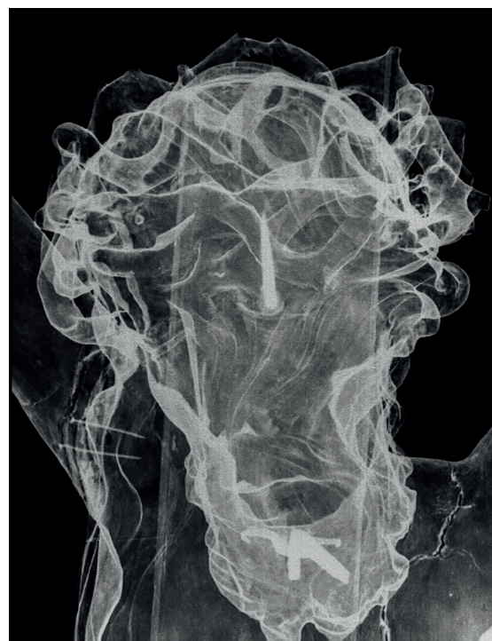
Fig. 3, 4: X-ray images of the head of Christ by Christian Ackermann which enable to detect different materials (colour image) and to inspect the inner structure of the artefacts (black and white image) (2018).