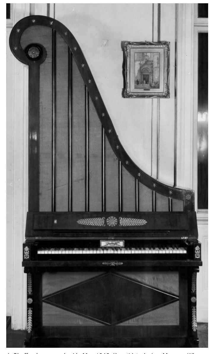
4 Giraffe piano, acquired in May 1943.