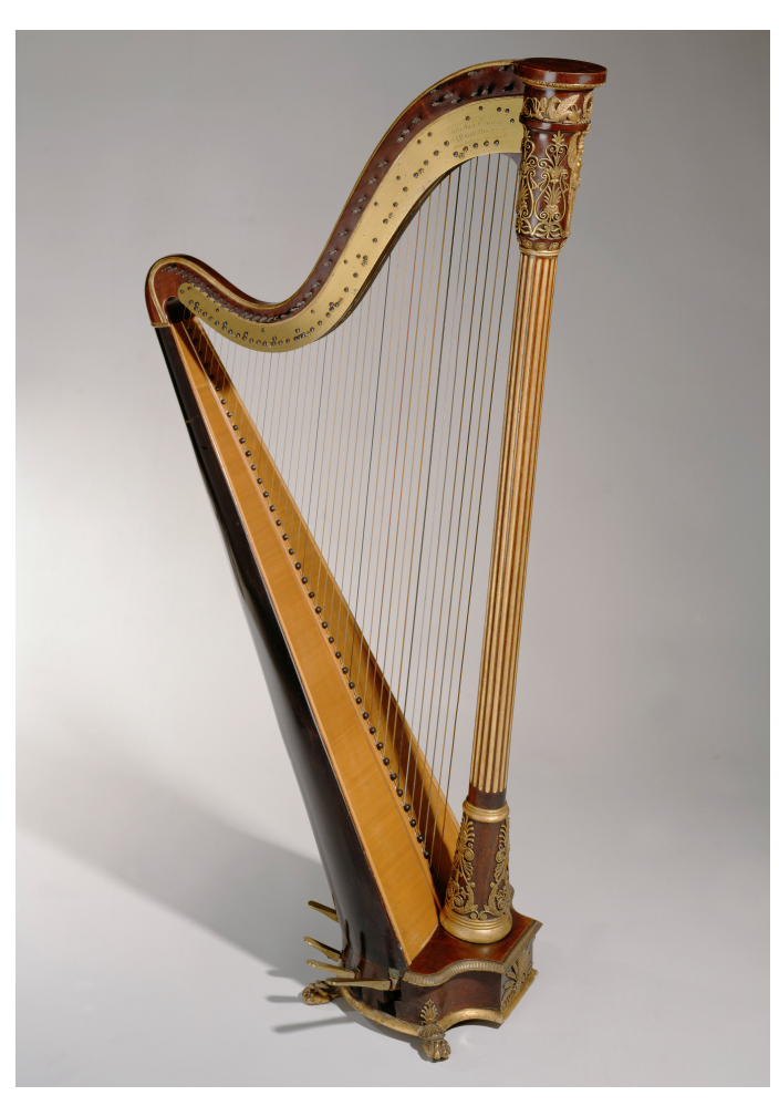
2 Double pedal harp, SAM 502, acquired February 1941. Kunsthistorisches Museum Wien © KHM-Museumsverband

double pedal harp (SAM 502; fig. 2) auctioned at the Dorotheum in February 1941, or the square piano (SAM 573; fig. 3) purchased there in March 1944.