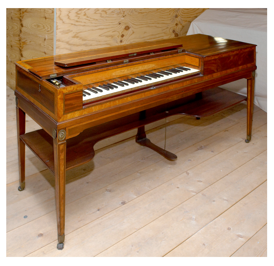
3 Square piano, SAM 573, acquired March 1944. Kunsthistorisches Museum Wien

»The Lehmann«,<sup>29</sup> Vienna's digitalized address registry, has also become an integral part of this work. Likewise, researchers access continually updated genealogical databases such as genteam.at.<sup>30</sup> In addition, there are specialized databases listing victims of the Nazis, such as the Shoa database maintained by the Dokumentationsarchiv des Österreichischen Widerstandes (Documentation Centre of Austrian Resistance).<sup>31</sup> The IKG also makes available their extensive databases, which have greatly expanded during the last two decades.