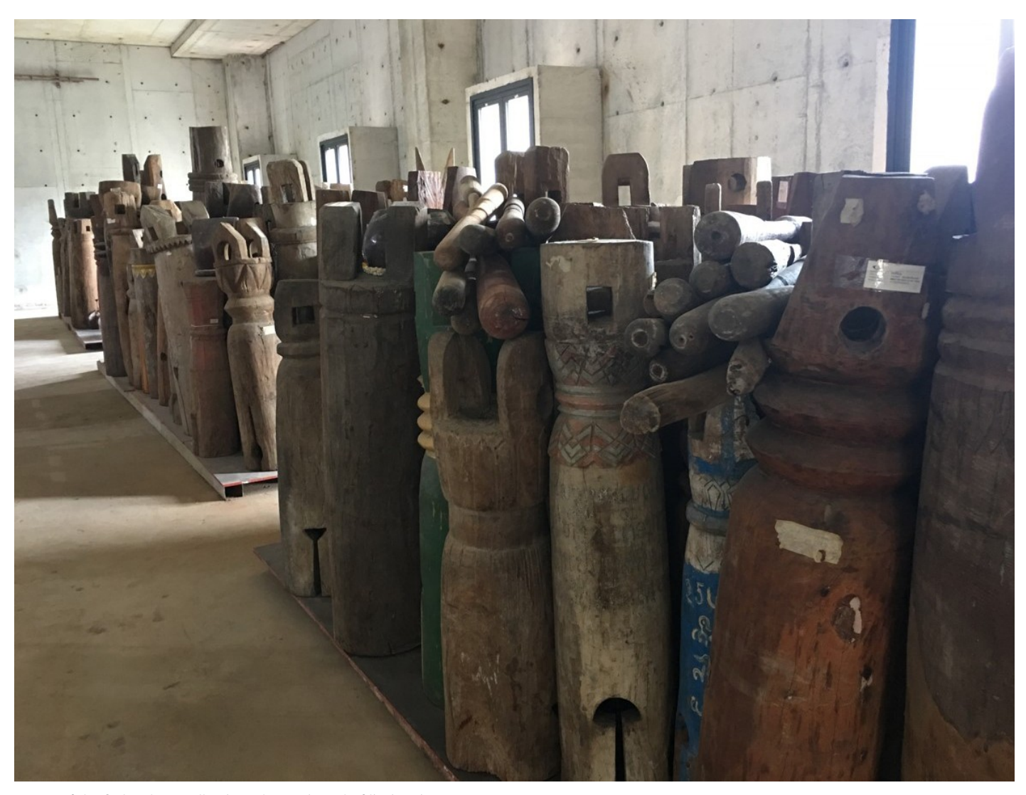
4 Part of the SEAM drum collection.

fore the objects will illustrate the process of musealization at SEAM. Different kinds of networks will contribute to the museum's fast growth. All those involved with SEAM, visitors, interested citizens, the people in the villages – all share the responsibility for the materials and for the intangible and symbolic contents of SEAM. Consequently, SEAM is a true example of a museum that is grounded in a »heritage community« since the network that makes it grow and that holds its collection together is of utmost importance (fig. 4).