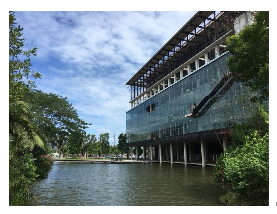
1 Exterior view of the SEAM, Bangkok.