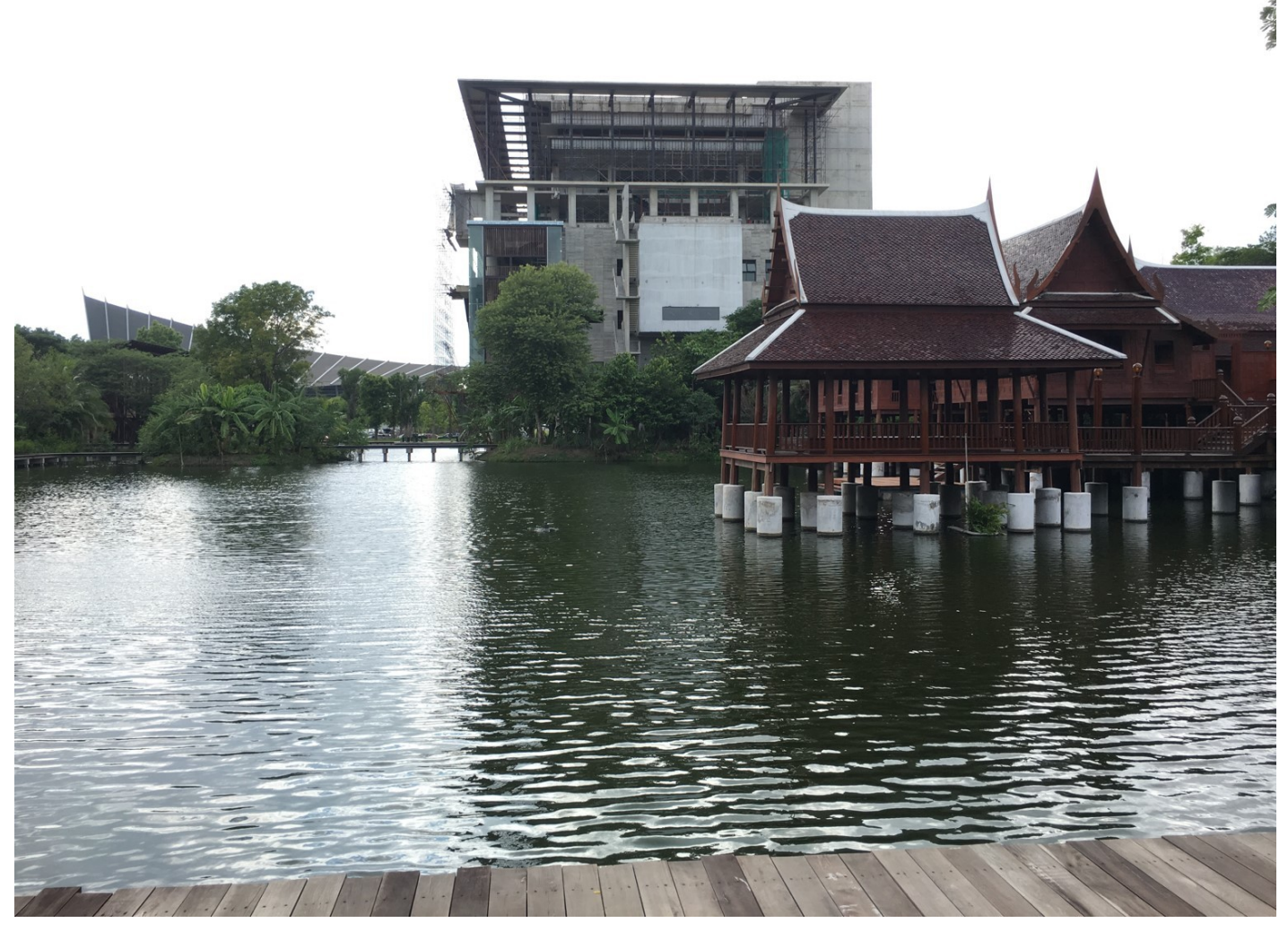
2 Exterior view of the SEAM, Bangkok.

Latin-American countries. In fact, just a few years after the promulgation of the 2003 Convention, the world cultural heritage map had already lost much of its European predominance. Asian countries such as China, Japan, South Korea, and India very soon produced a list of manifestations of their own centuries-old (and, in some cases, even millennia-old) national cultural heritage.