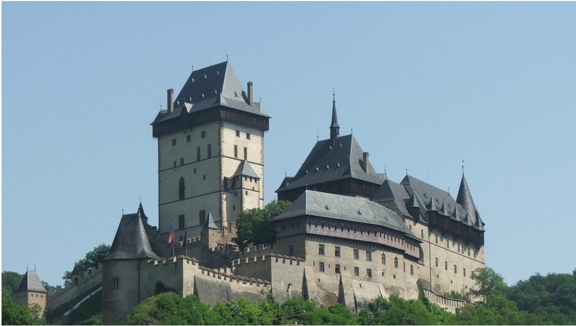
Fig. 1 Castle of Karlstein, Czech Republic.