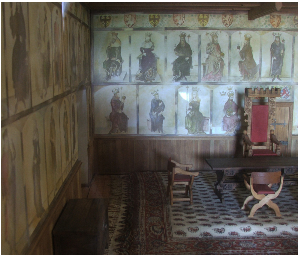
Fig. 2 Reconstruction of the Hall of the Luxembourg Genealogy, Karlstein Castle.