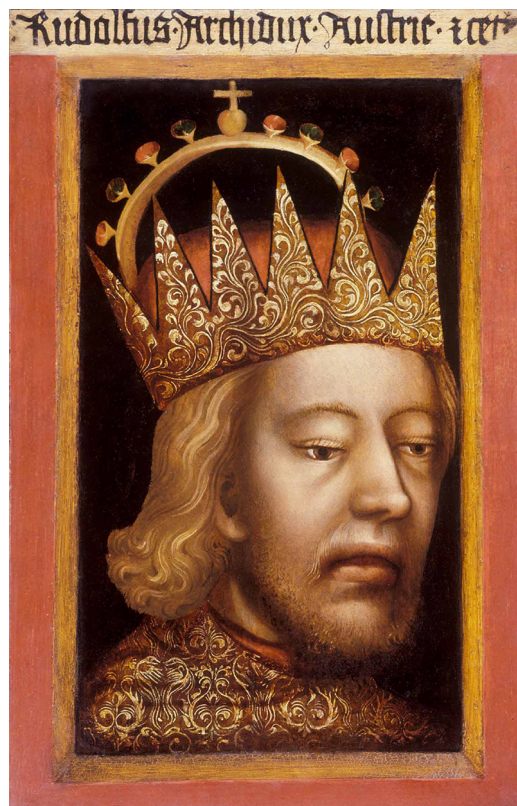
Fig. 5 Portrait of Rudolf IV of Austria, Vienna, Dom- und Diözesanmuseum (PD-Art template).

We can, therefore, reconstruct the Prague cycle as a series of 120 portraits, starting with four important monarchs from antiquity: Ninus, Alexander the Great, Tola, Romulus. It was continued with the Roman emperors from Julius Caesar onwards. The Byzantine emperors were also represented and, finally, the Holy Roman emperors ended the cycle.