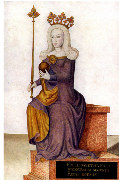
Figs. 6 and 7 Figures of Charles IV and his mother, Elizabeth of Bohemia, from the Luxembourg Genealogy painted on the walls of Karlstein Castle, now lost. Copies preserved in the Codex Heidelbergensis , Prague, Archives of the National Gallery, AA 2015.