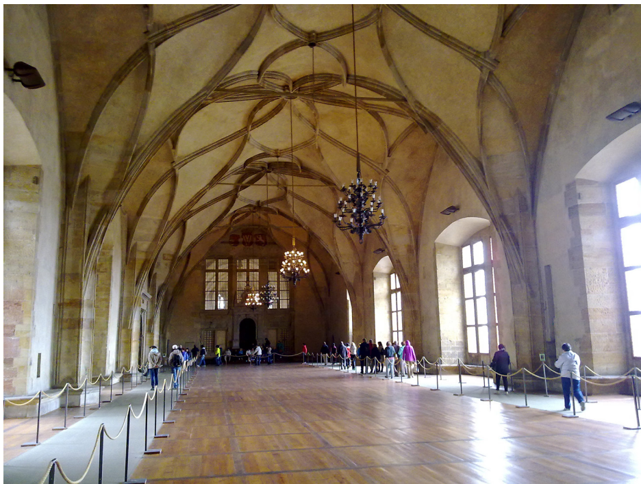
Fig. 3 Prague castle, Wladislaw Hall.

The portrait gallery commissioned by Charles IV was situated in the room, which is known today as the Hall of Wladislaw (fig. 3). To reconstruct the original (that is to say, the fourteenth-century) state of the castle, we may avail ourselves of the renovation reports of the castle dating to the twentieth century and containing stratigraphic measurements as well as of a contemporary document concerning the original construction: the Coronation Order of the Bohemian kings, recently analysed by Richard Němec. 16