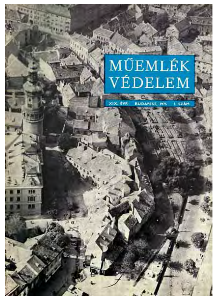
Fig. 1: The front-cover of the revue MŰEMLÉKVÉDELEM from 1975 showing a detail from the historic city centre of Sopron

It was only many years later (in 2012) that it became possible to read the memoirs (Dercsényi and Bardoly 2012) of Professor Dezső Dercsényi about the background and details of this story with some specific mentions of the EAHY 1975. "In his yet unpublished recollection entitled The Europe Prize of Sopron revives the interesting background events of awarding the Europe Monuments Prize to Sopron in 1974 [...] Dercsényi discusses in detail the circumstances, political negotiations and background agreements in the Eastern bloc of divided Europe, through which it was possible to accept a prize from a Western Foundation – especially from one operated in the German Federal Republic – as a result of