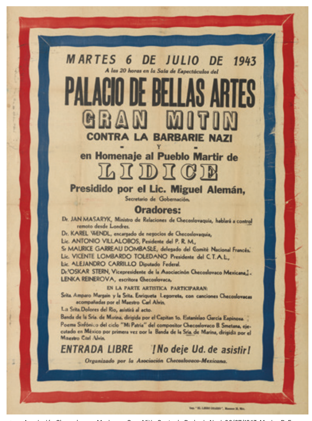
Fig. 3 Asociación Checoslovaco-Mexicana: Gran Mitin Contra la Barbarie Nazi, 06/07/1943, Mexico D. F.