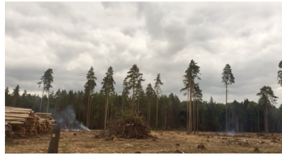
Fig. 3: Video used for projection

The concrete sculpture has a cubic shape to recreate abstract associations to human shaped buildings. By housing ourselves and filling forests with concrete, humans destroy animals’