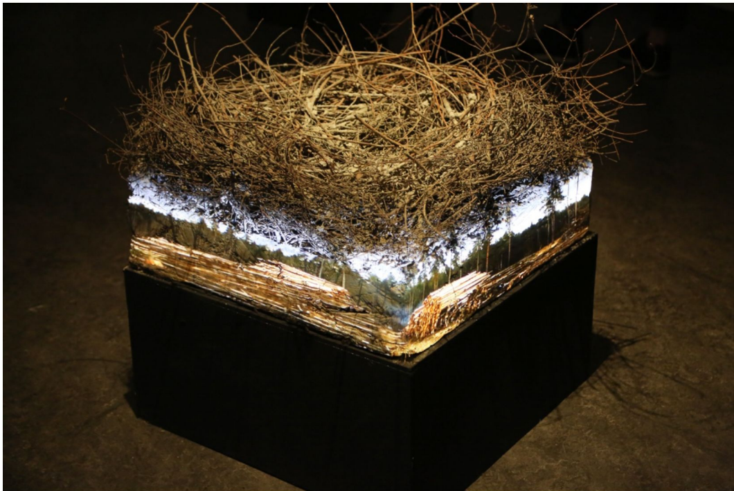
Fig. 1: Post-Penetration: Projected video on sculpture

ABSTRACT: One traditional and important aim of art is to reflect on ongoing events and to point at problems of society. Thus, beside aiming for beauty and aesthetics, art has always tried to inspire discussions as well as to trigger thought and questions. In this work, the term “Post - Penetration” is used with the intention to create a feeling of backwash effect. Every action, every movement, every step has its own consequences. In chaos theory, the butterfly effect is the sensitive dependence on initial conditions in which a small change in one state of a deterministic nonlinear system can result in large differences in a later state. Nevertheless, most of the human beings are not aware of the effect of their actions. Such lack of awareness can penetrate nature. As a result, we are going to face post - penetration effect. The installation represents one element of possible scenarios. Post - Penetration is a project dedicated to deforestation topic. An installation combines both, sculpture and documentary video. It is made to document occurring events that have a big influence on ecological condition of the earth.