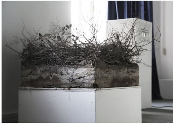
Fig. 2: Sculpture without video projection