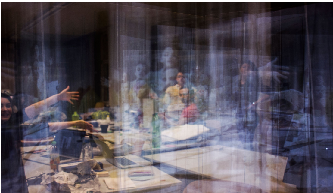
Fig. 1: Playful interactions captured by real-time video projected onto a layering of Plexiglas

This installation presents the multiplicity of one view in an array of reflections through an arrangement of numerous Plexiglas and a projected real-time camera feedback of the viewing area so that the viewers can compare the difference of the direct and the projected image, see Fig. 3.