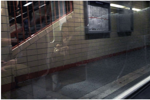
Fig. 2: Inspiration: deceptive reflections in the S- Bahn

have to act as if we were thinking about something else or by acting like we were not looking. We also notice due to gaze detection, the result of evolution, if someone is looking at us. But in the case of this installation, the viewer does not know where the actual location of a person is while he is observing him and gives idea of how reality can be perceived.