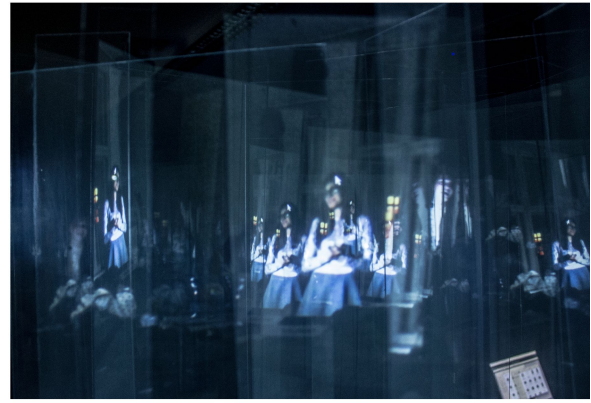
Fig. 3: Sneak Peak installation at a glance

[3] Juxtaposition , an installation by Volker Kuchelmeister that juxtaposes the Tasmanian wilderness and the extreme urban development of Hong Kong. This exhibition explores the boundaries between real and virtual space and the relationship between observer and