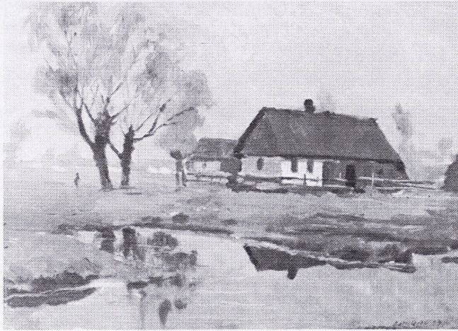
"Під Костополени" 1957р. Картон, олія