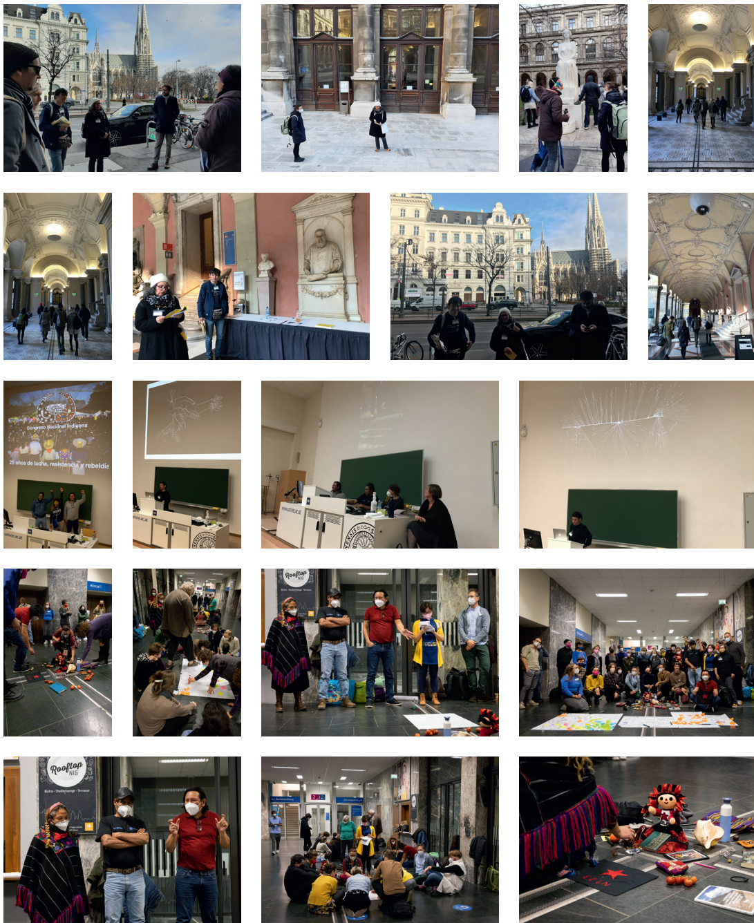
Fotos der Tagung De/Kolonisierung des Wissens / Photos of the conference De/Colonizing Knowledge