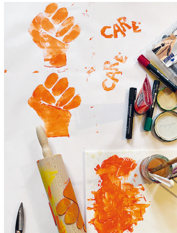
Protest poster-workshop 'Poster, Power, Protest' with Anna Unterstab and Anne Meerpohl