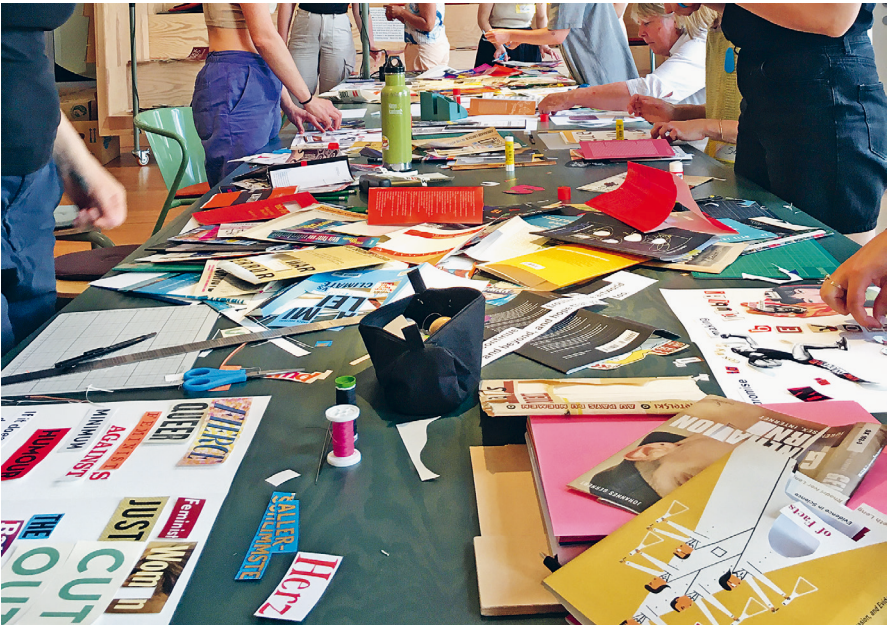
Workshop 'Feministin zu zine' with Büro Klass