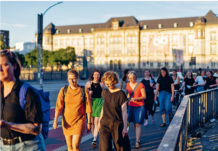
'Design, Walk & Talk: A seat at which table?' in collaboration with Design Zentrum Hamburg