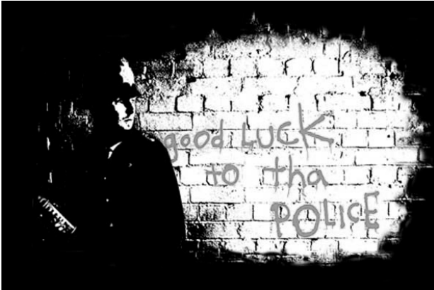
Fig. 76: good LUCK to tha POLICE, ca. 2003.