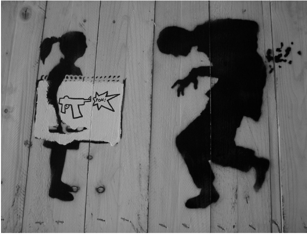
Fig. 78: Girl shooting man with drawn machine gun on sketch block, stencil spray paint on wooden boards 2003.