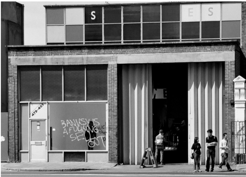
Fig. 72: Turf War, 2003.

Turf War was the first and largest solo exhibition retrospective Banksy organized himself since his Rivington Street show in 2000. The exhibition was planned to run from July 18 to 21, 2003, but was canceled early and only ran for the first three days. The show was announced on three different flyers. The location, however, was only disclosed only a day in advance by email. The venue was an empty warehouse (now demolished) on Kingsland Road 479–483, E8, in London's Dalston district. 1 A “turf war” is “a fight or an argument to decide who controls an area or an activity.” 2 It is also used as a slang term by graffiti artists who often spray over tags and pieces by other artists to mark their territory.