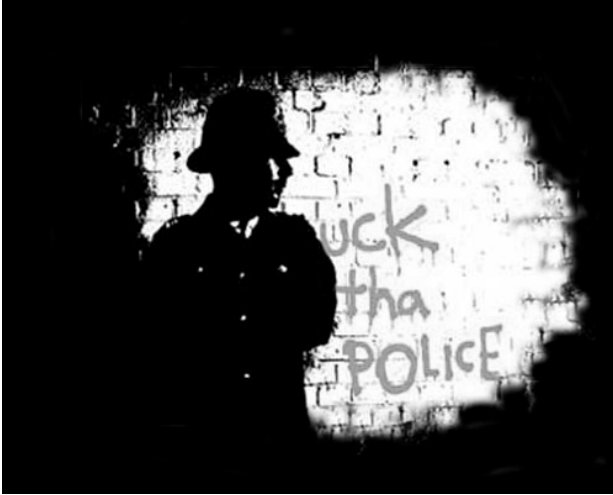
Fig. 75: UCK tha POLICE, ca. 2003.